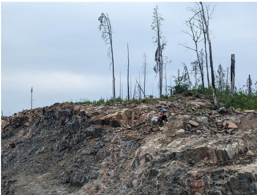
Figure 1 – HTM Sampling at Werner Lake.