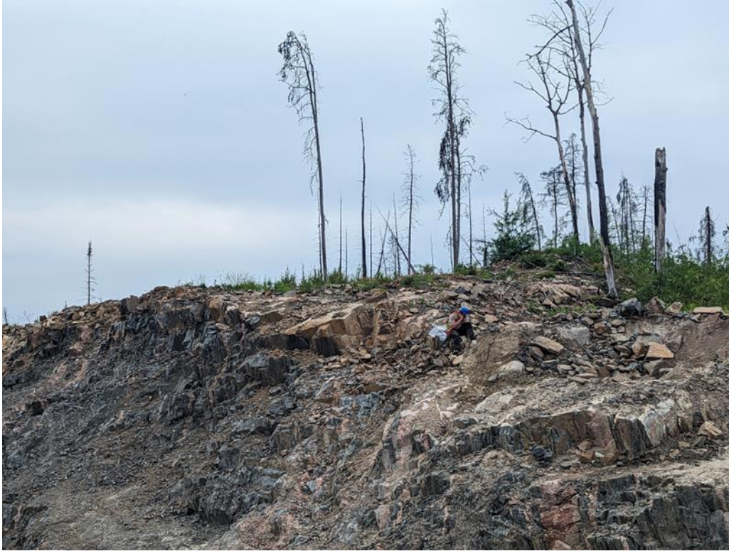
Figure 1 – HTM Sampling at Werner Lake.