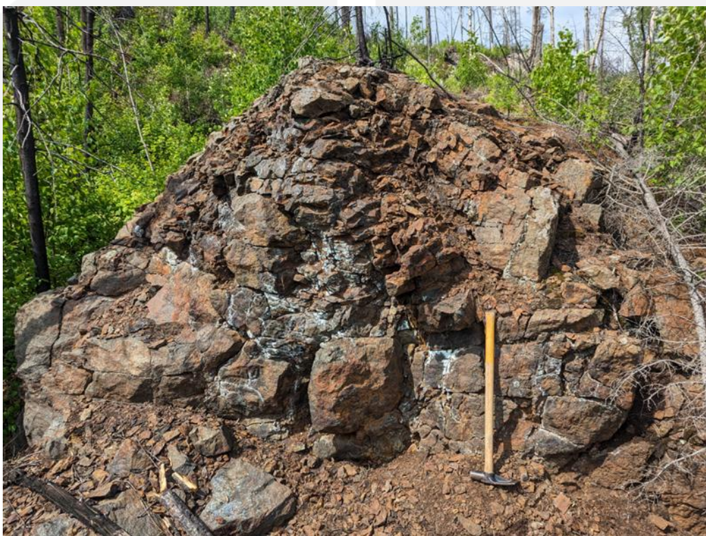
Figure 2 - Werner Lake outcrop and sampling zone