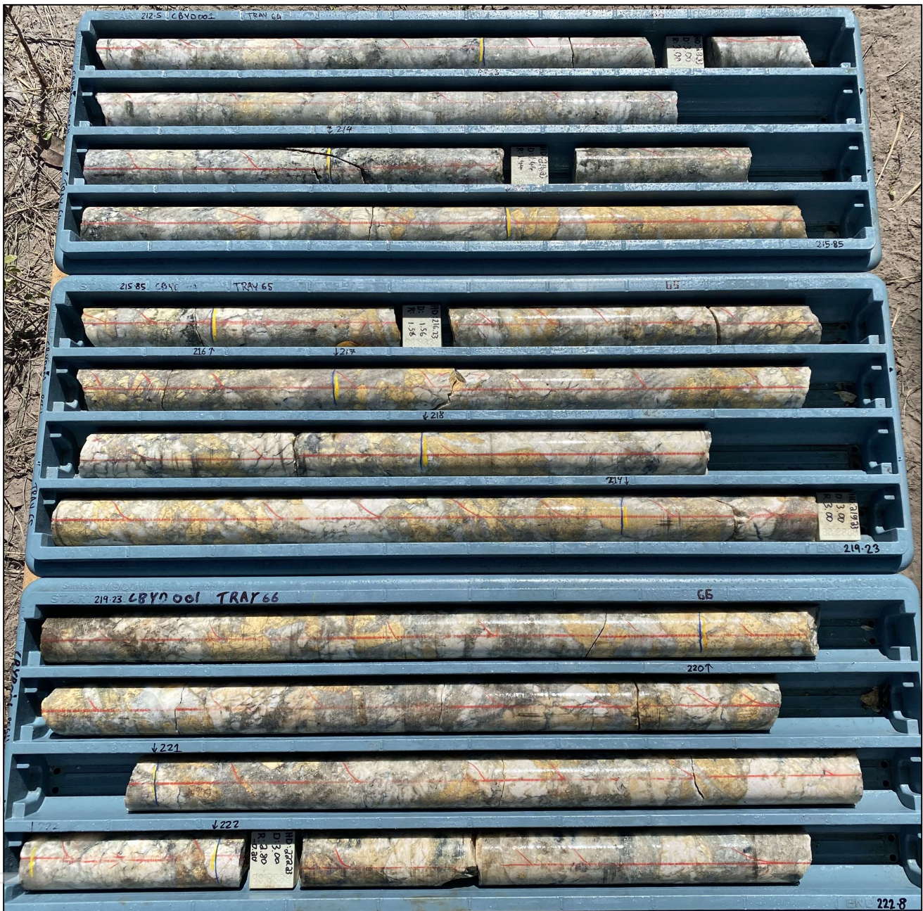
Table 1. Visually estimated spodumene content of the down-hole pegmatite intersections in drill-hole CBYD001. 7