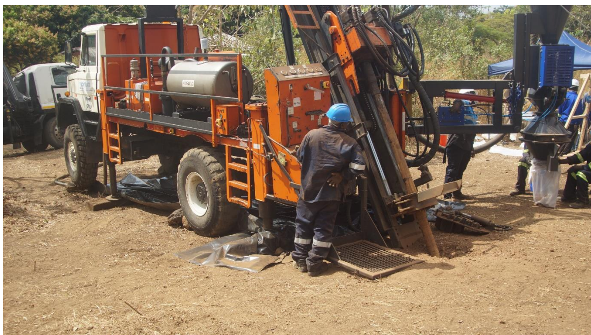
Figure 1: RC Drilling underway at Machinga HREO + Nb Project

The objective of the program is to define extensions of mineralisation along strike to the north, with the aim of proving up additional targets for drilling. Samples were despatched to ALS Laboratories in Johannesburg, South Africa for preparation, prior to a full suite analysis in Perth. Results are expected early August.