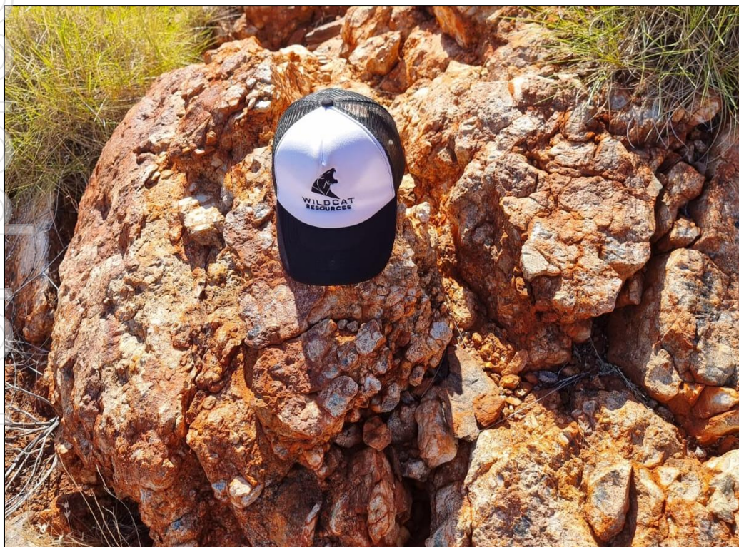
Figure 1 – Numerous additional pegmatite outcrops have been identified at Tabba Tabba