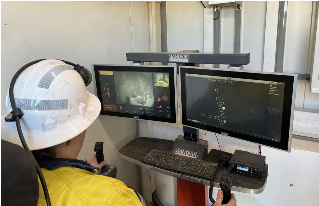
Figure 2 –Underground remote-control loading taking place from surface remote facility at Abra (Byrnescut Mining) (Photo 23 June 2023).