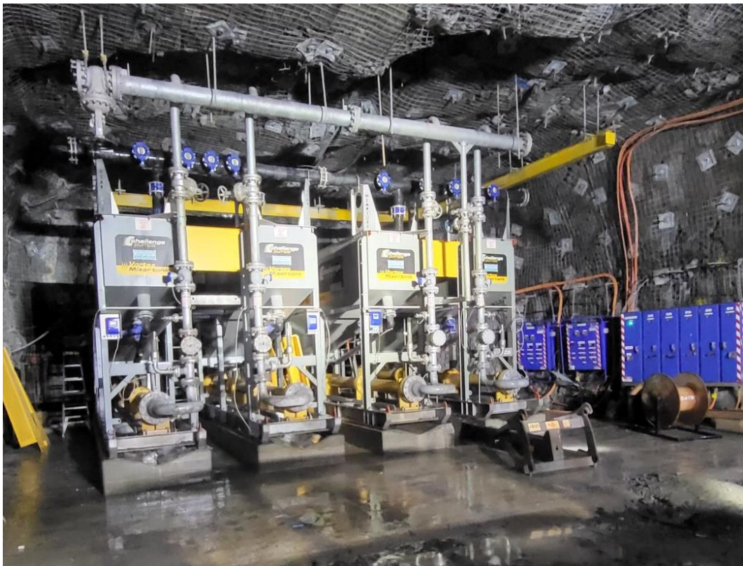
Figure 3 – Fully commissioned primary pumping station underground at Abra (Photo 23 June 2023).