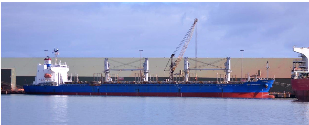
Figure 1 – Vessel “Ruby Confidence” containing Abra’s June concentrate shipment at Geraldton Port bound for JV partner Toho Zinc’s Chigirishima smelter and refinery in Japan (Photo 23 June 2023).