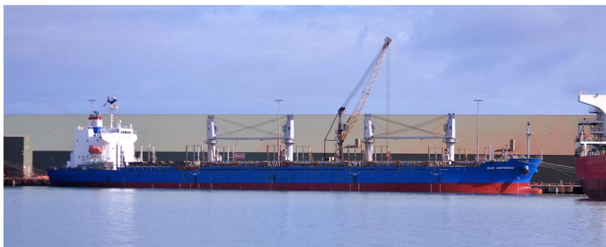
Figure 1 – Vessel “Ruby Confidence” containing Abra’s June concentrate shipment at Geraldton Port bound for JV partner Toho Zinc’s Chigirishima smelter and refinery in Japan (Photo 23 June 2023).