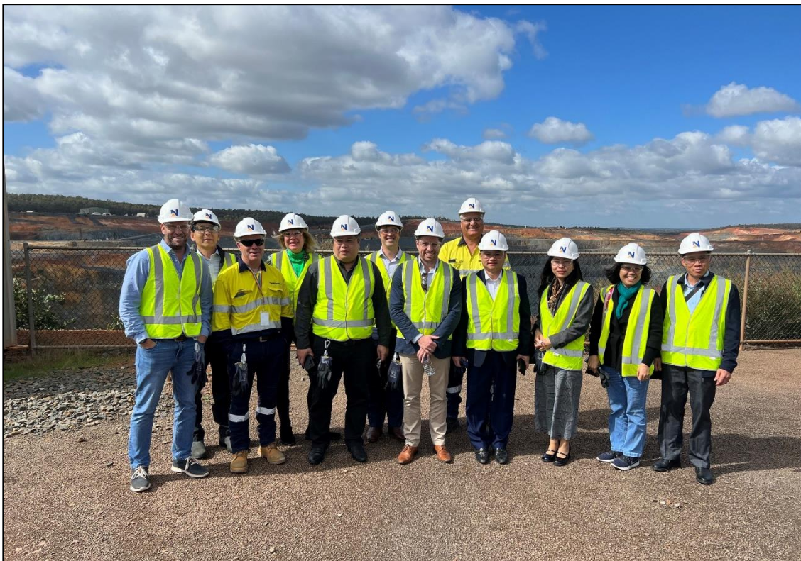
Figure 1. Son La Delegation Visit to Perth

Blackstone Minerals Limited (“Blackstone” or the “Company”) is pleased to provide an update on the Company’s strengthening government relations in Vietnam.