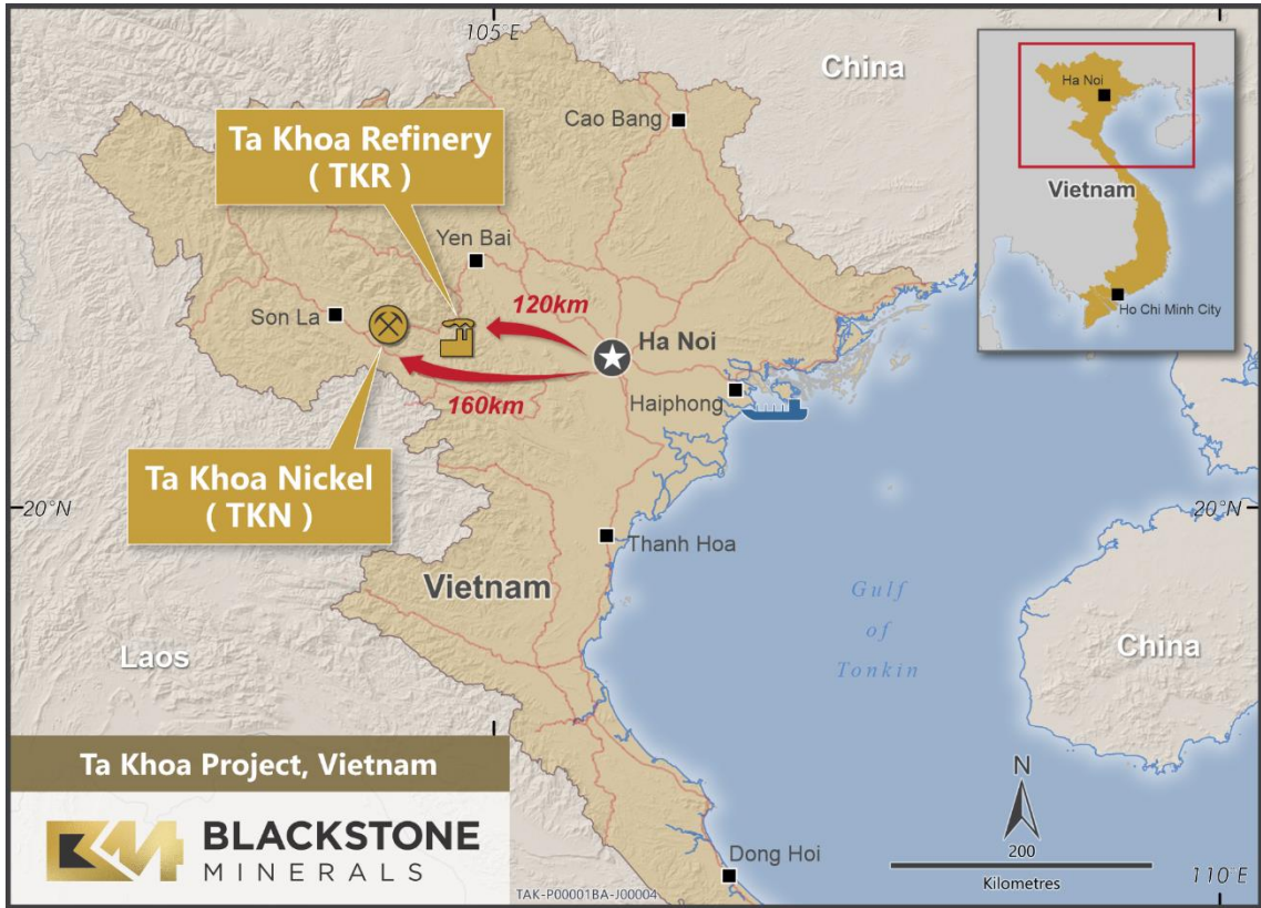
Figure 3. Ta Khoa Project Location