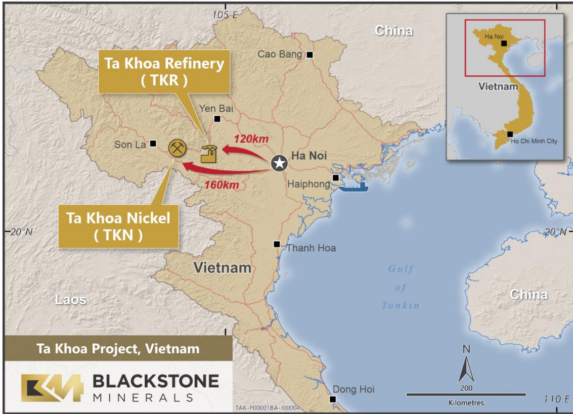
Figure 3. Ta Khoa Project Location