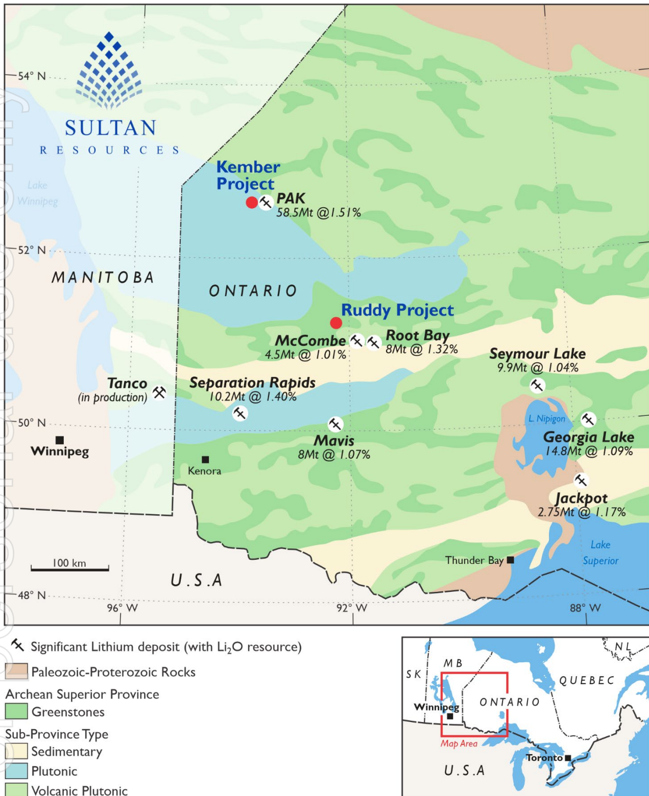
Figure 1: Location of Kember and Ruddy Projects in relation to known Lithium deposits, Northwest Ontario

N.B. PAK (TSXV:FL) total resource taken from NI43-101 instrument effective April 28, 2023