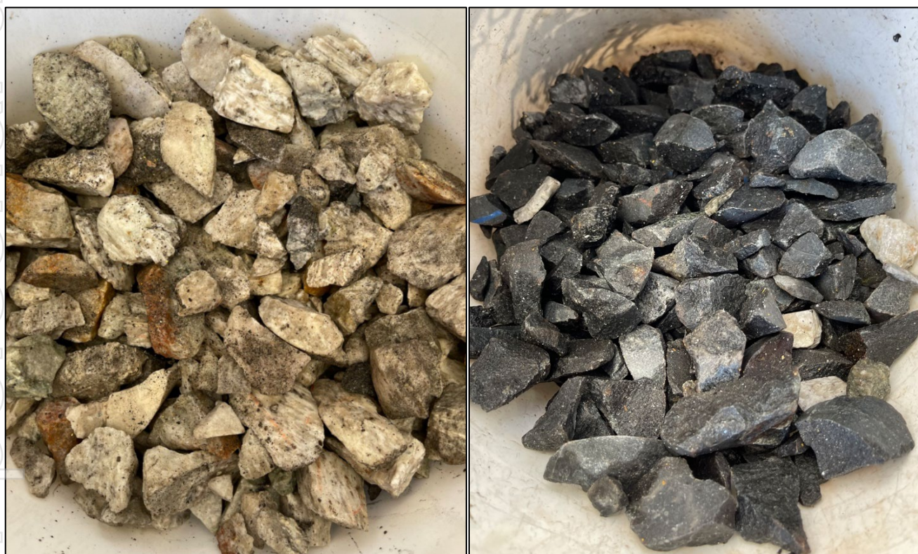
Figure 2. Ore sorter product streams, Accepts (Left) and Rejects (Right)

Figure 2 shows a typical example of the ore sorter product streams after a single pass through the machine.