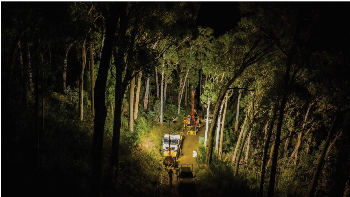
Figure 1 - DDH1 Rig 61 set up on Fergusson's Dyke, Dorchap Track

Visit our webpage: www.dartmining.com.au