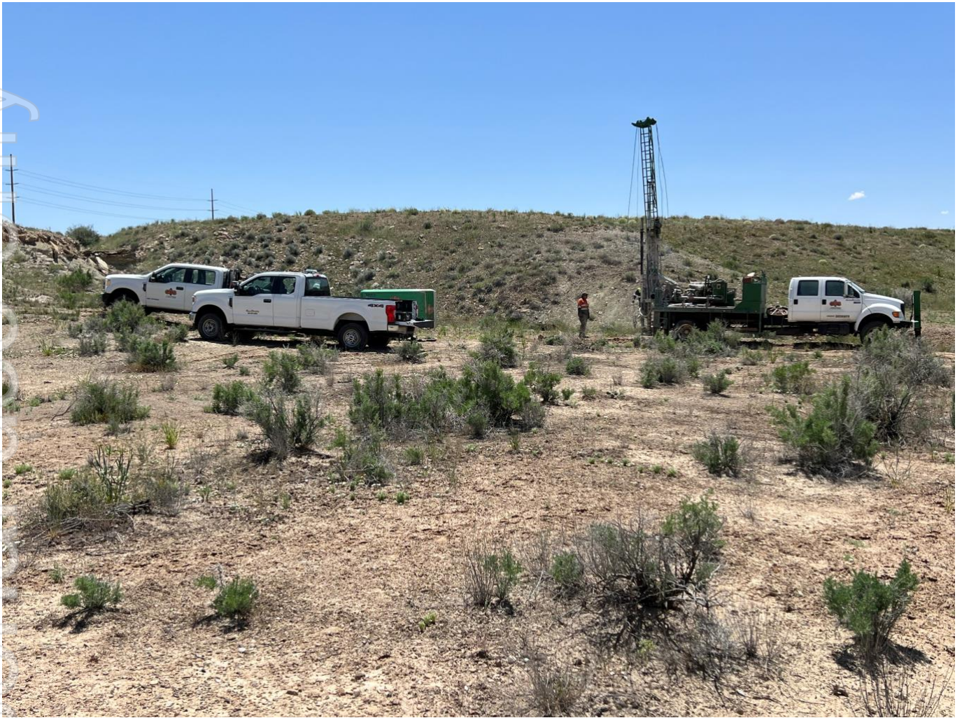
Figure 1: Photo showing the drilling rig on site carrying out geotechnical engineering work. Powerline infrastructure within the property is also shown.

The Engineering Study will deliver a geotechnical report, which will provide a summary of the analyses, findings and recommendations for possible construction locations within the property and will incorporate factors including: