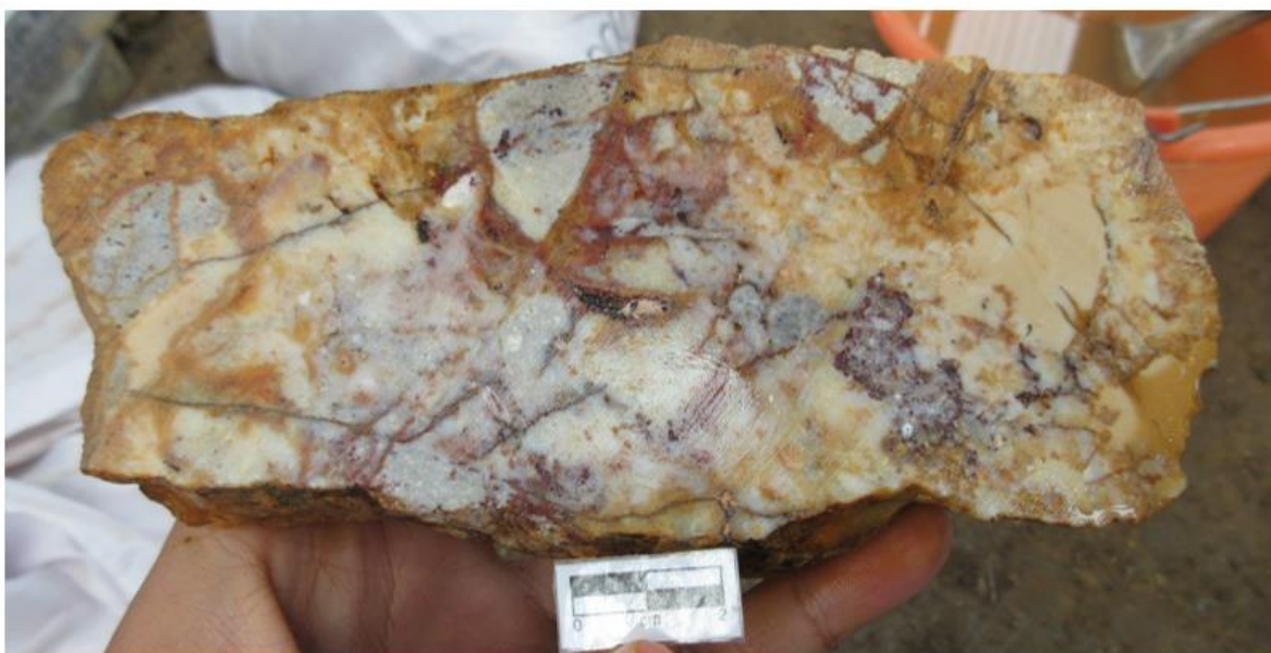
Figure 2: Samples collected from the Kareung Reuboeh prospect. TOP: from quartz stockwork zone, 1-2m wide, intensely silicified andesite wall rock, 28.42 g/t Au. BOTTOM: from quartz stockwork zone, 1-2m wide, intensely silicified andesite wall rock, 58 g/t Au.