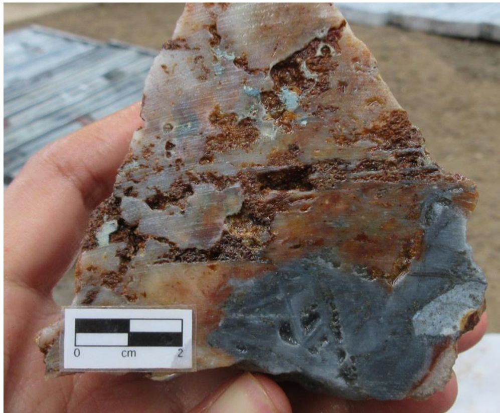
Figure 3: Samples collected from the Aloe Rek prospect area. TOP: quartz vein sample taken from artisanal mining pit, at 20m depth. Vein was 3-5m wide, crystalline quartz with bladed texture, oxidized, 14.9 g/t Au, 22.1 g/t Ag. BOTTOM: sample of quartz vein, taken at 20m depth from an artisanal mining shaft. Sample contains abundant arsenopyrite in lower right part of the quartz. 9.1 g/t Au, 20.5 g/t Ag.