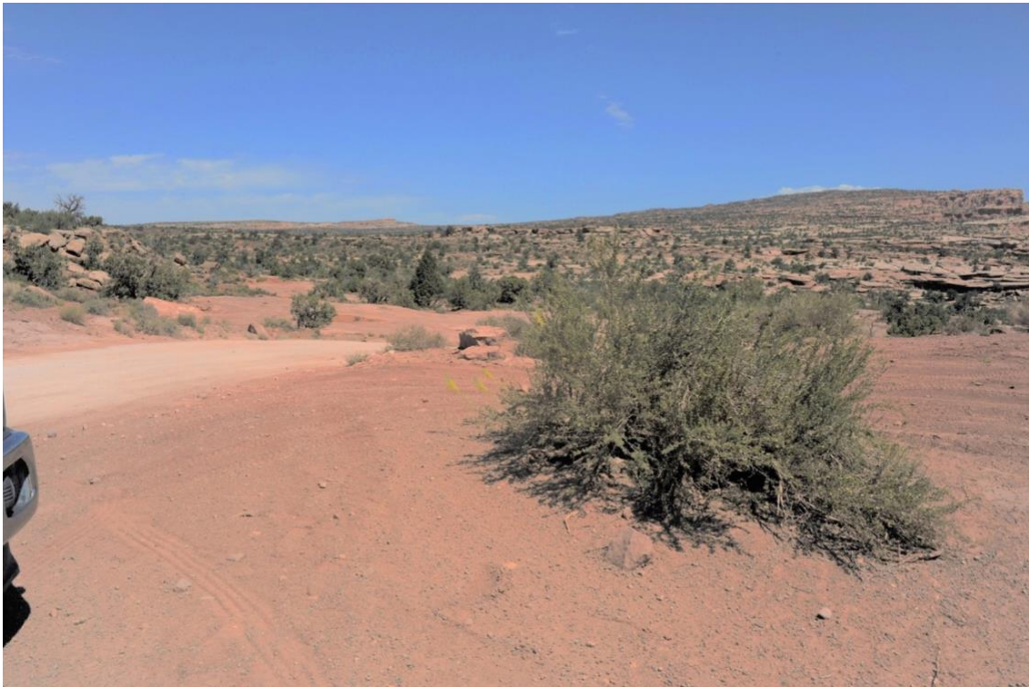
Figure 3: Looking north towards the newly stake claim area

This announcement has been authorised for release by the Executive Chairman and CEO.