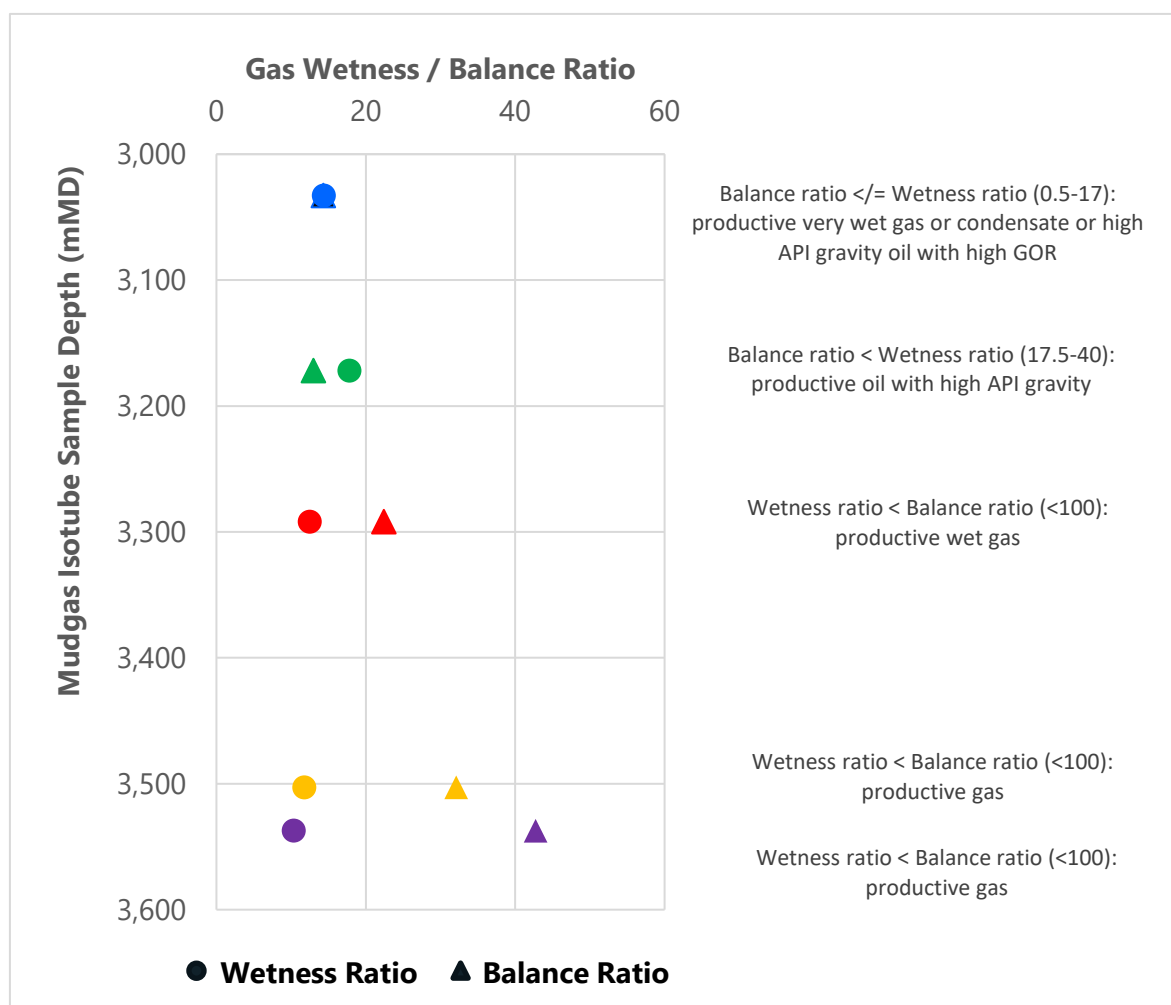
Figure 1 - Wetness and balance ratios vs. depth for Upper Angwa mudgas isotube samples indicating increasing gas dryness with depth

Lab analysis indicates the presence of wet gas, gas-condensate, and potentially volatile (light) oil with associated gas within the Upper Angwa formation. The samples show a general trend of increasing gas dryness (lower condensate gas ratio/yield) with depth, however at a relatively high wet gas composition.