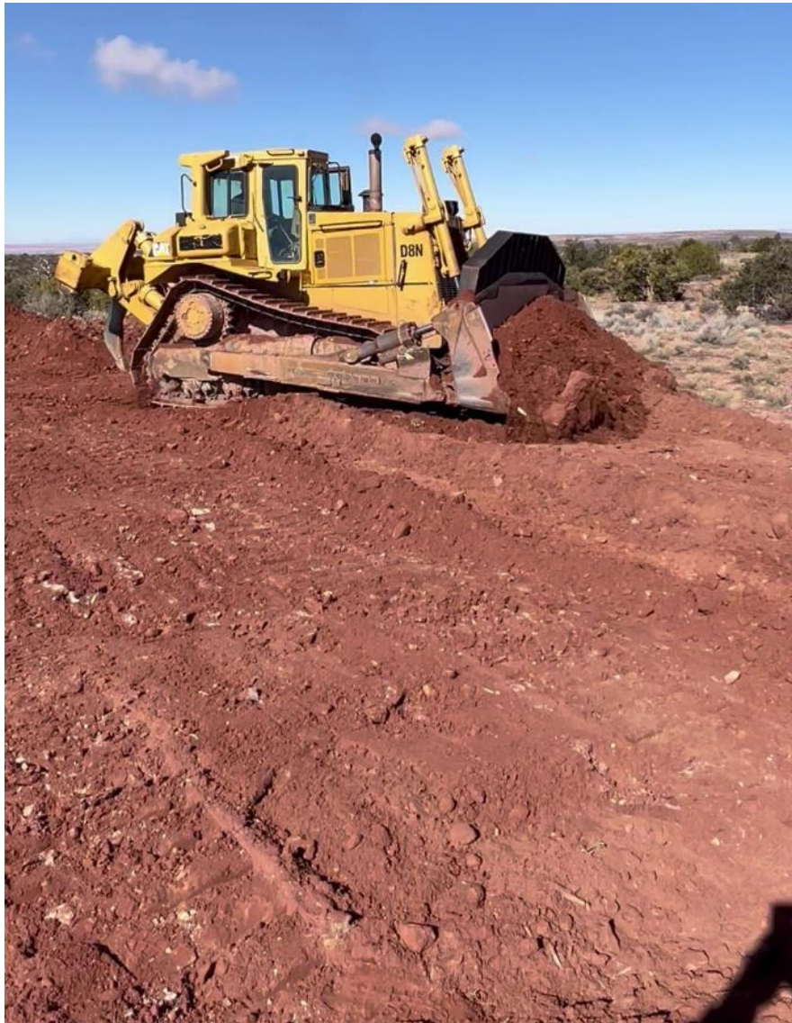
Figure 1: Re-instatement of the original Mineral Canyon pad in the Western region of the Paradox Lithium Project.