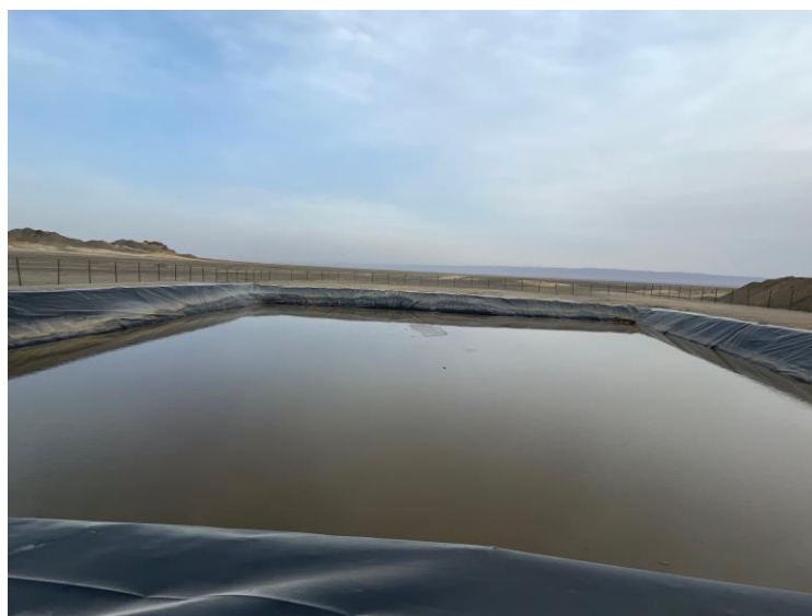
Looking South from the Nomgon Pilot's pond to the Chinese border

We will continue to garner data from the pilot until the middle of the year and then aim to initiate a formal process with the Government to start to move to a commercial production phase. Our more regular annual CBM exploration and appraisal drilling program in the Nomgon PSC will proceed in parallel and this is due to commence very shortly.