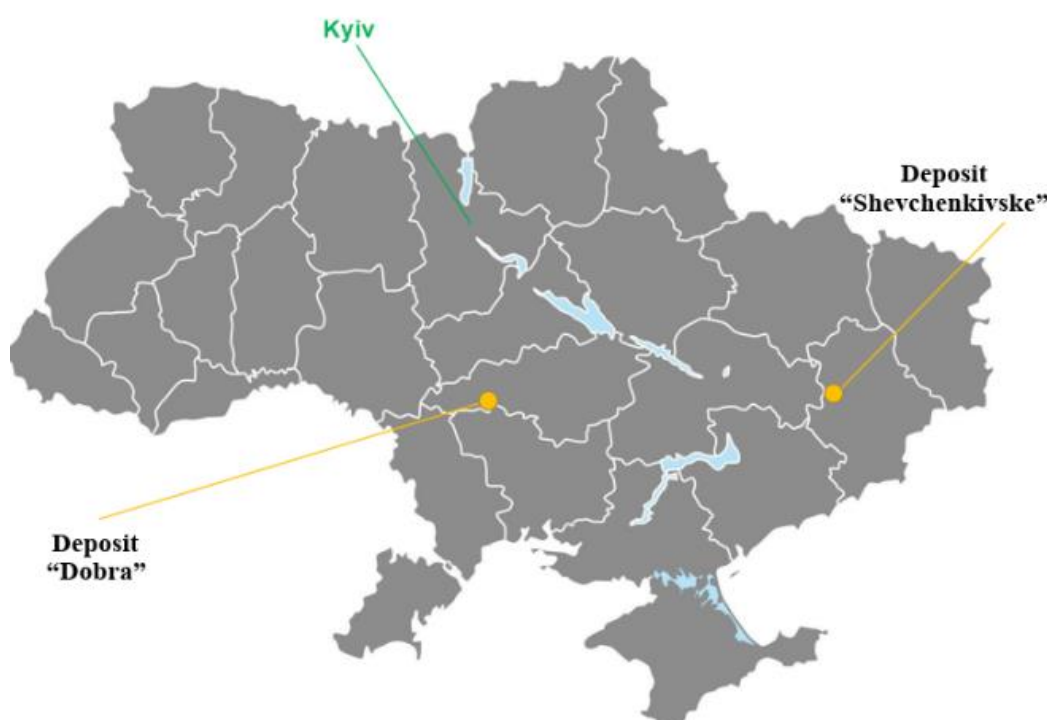
Figure 3 - Location of the deposit Shevchenkivske and Dobra in Ukraine

On 28 February 2023, the Company announced that it had renegotiated the terms under which EUR will acquire European Lithium Ukraine LLC (formerly Petro Consulting LLC) ( European Lithium Ukraine ), a Ukraine incorporated company that is applying (through either court proceedings, public auction and/or production sharing agreement with the Ukraine Government) for 20-year special permits for the extraction and production of lithium at the Shevchenkivske project and Dobra Project in Ukraine (refer figure 2), from Millstone and Company Global DW LLC ( Millstone )( Millstone Transaction ).