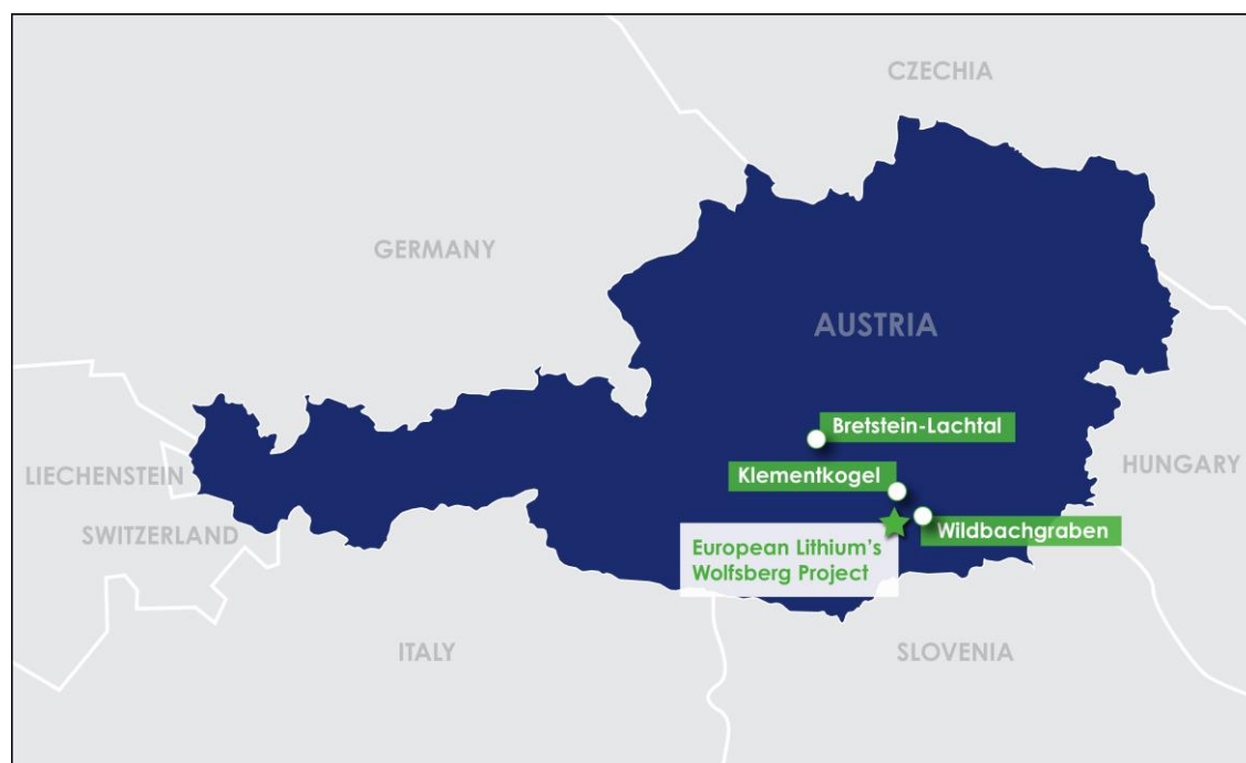
Figure 2 – Austrian Lithium Projects location.

that is considered prospective for lithium occurrences in the Styria mining district of Austria (refer Figure 2).