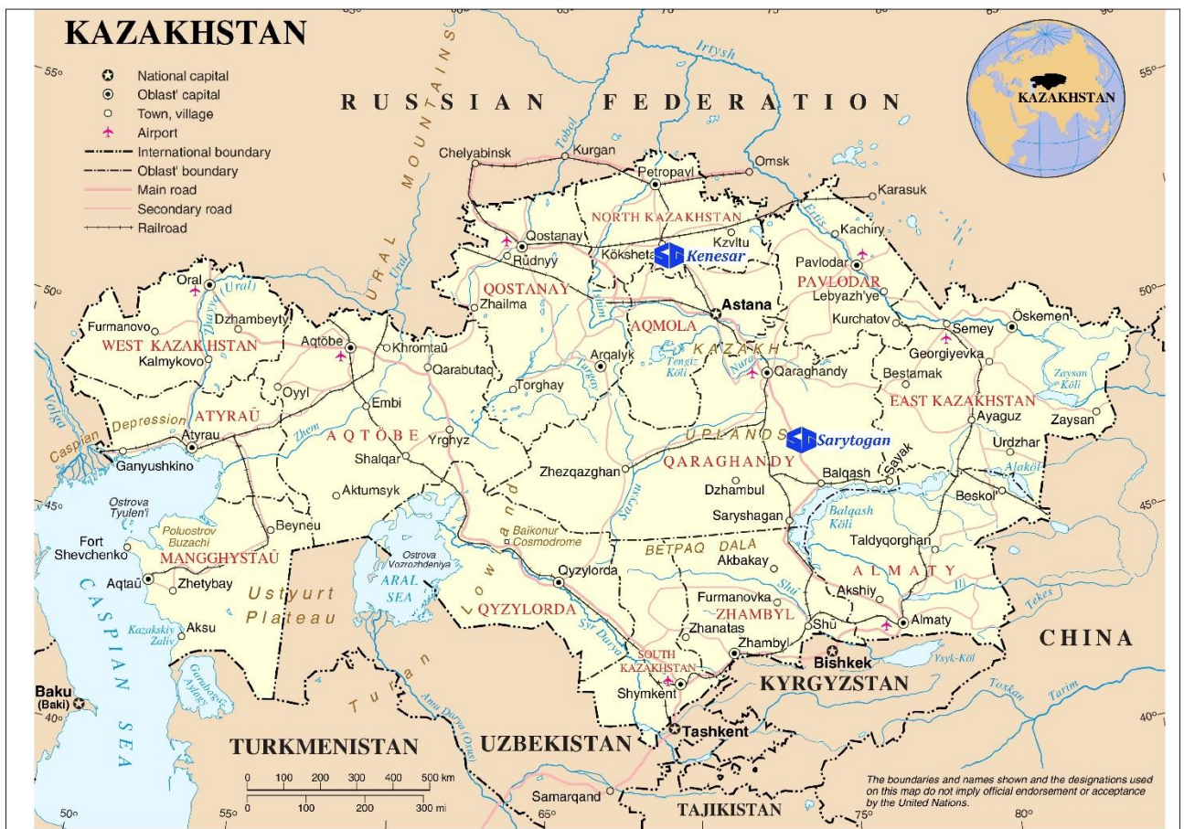
Figure 2 - Kenesar and Sarytogan Project Locations

Sarytogan Graphite Limited's 100% owned subsidiary company Ushtogan LLP has now been granted an exploration licence to explore 150 graticular blocks (309 km 2 ) for minerals.