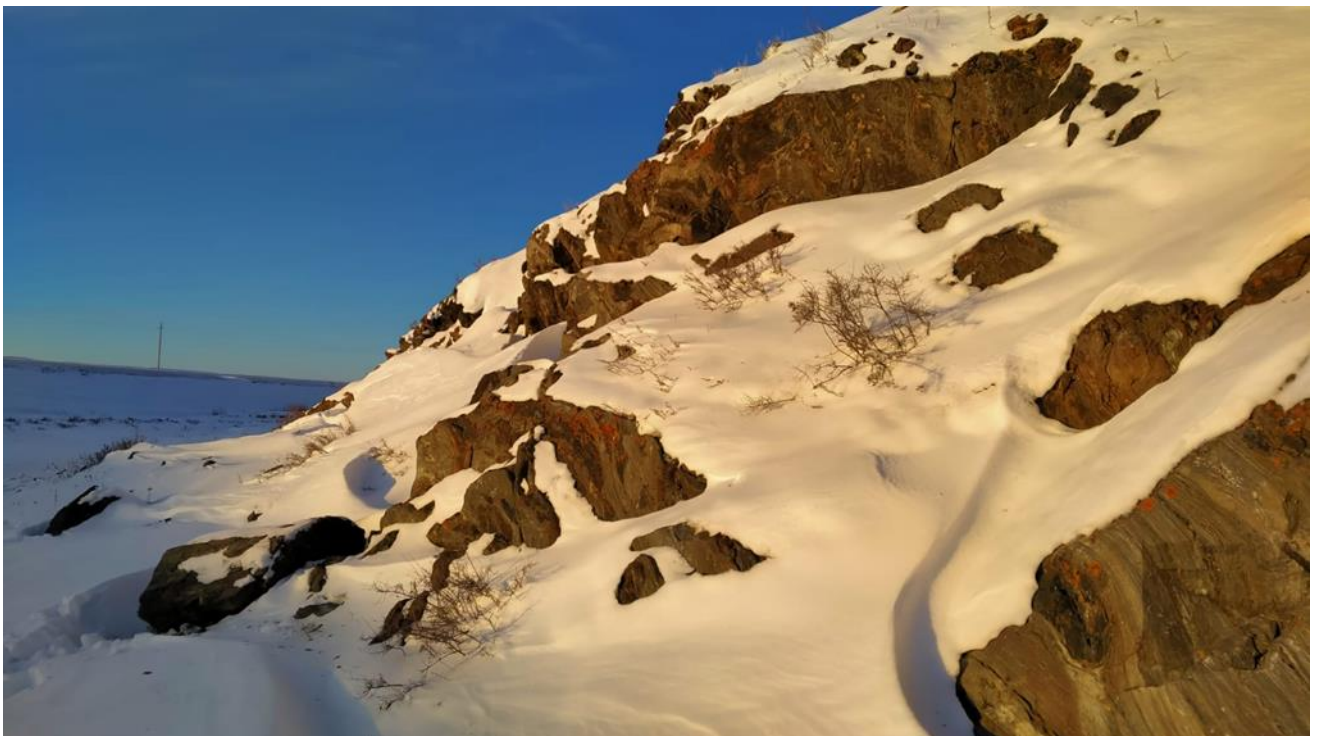
Figure 1 - Outcropping graphitic schist at Kenesar.

"Sarytogan's sustainable competitive advantage is our in-country exploration team's ability to identify, explore and develop mining projects in Kazakhstan. As we move into the studies phase for the giant and premium microcrystalline Sarytogan Graphite Project, our new Kenesar project provides a relatively low-cost opportunity to leverage our future position in the graphite market."