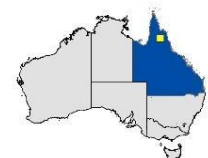
Image 1: Location of 147km 2 EPM 28013 ‘Sandy Mitchell’ and surrounding EPMs applied for.

Ark is now fast-tracking a planned infill drilling program with further details to be announced shortly. As well, the Company will undertake its own metallurgical test work and gravity separation testing to confirm that Sandy Mitchell's material is amenable to panning a concentrate and a commercial low-cost, fast start up gravity separation processing operation can be developed.