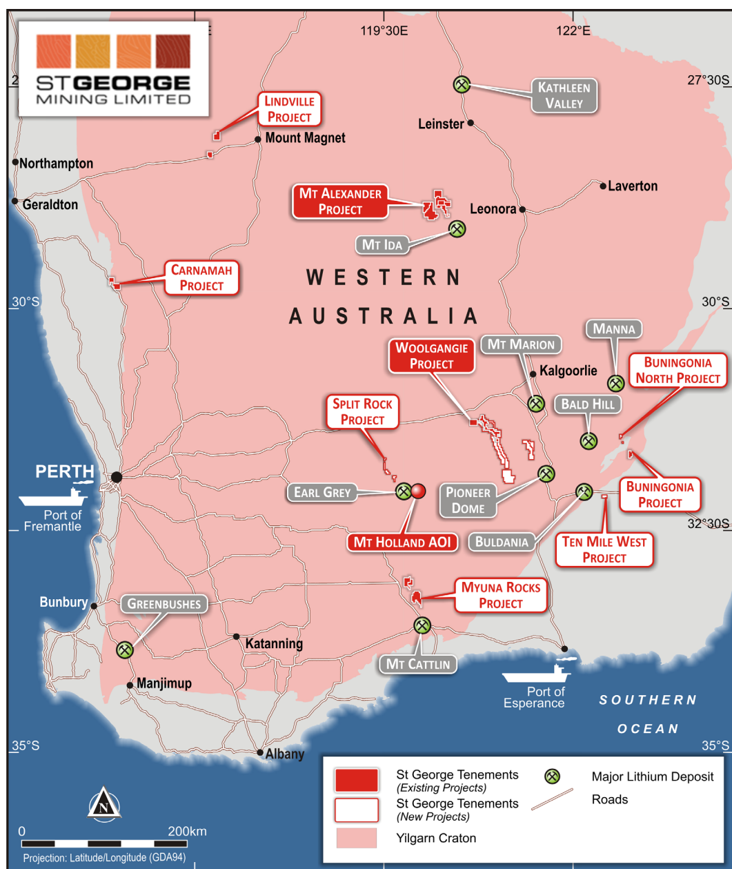
Figure 1 – map showing the location of the new projects acquired by St George as well as the existing Mt Alexander and Woolgangie Projects.

The tenements comprise 14 exploration licences – 13 have been granted and 1 is in application – covering a total area of approximately 653km 2 . The tenements comprise seven distinct projects.