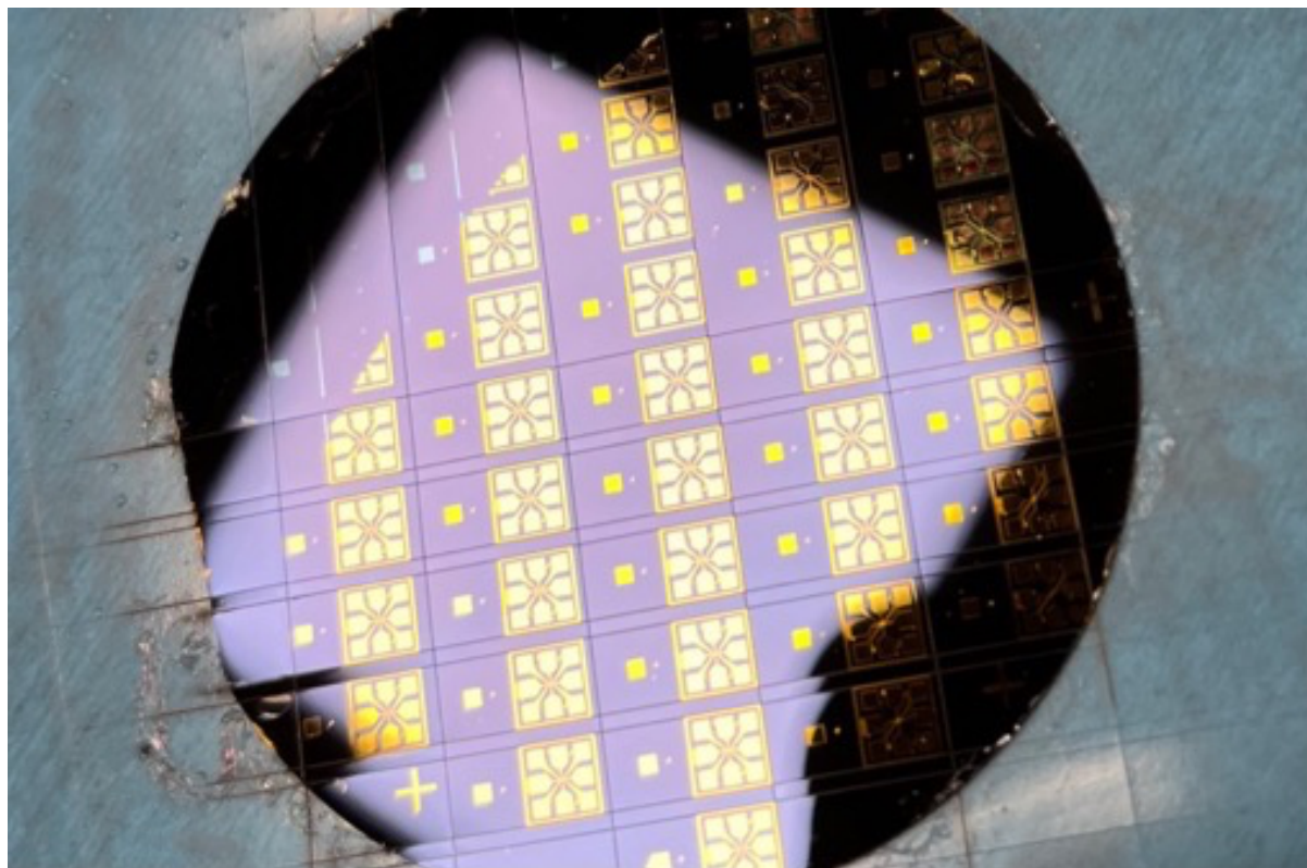
Image 1. A multitude of Archer quantum electronic devices defined by UV optical lithography on a commercial 2" silicon-on-insulator wafer substrate.

Archer continues to address the sector scarcity of available and accessible world-class facilities to perform the sophisticated quantum measurements required for ^{12}\text{CQ} chip development. Archer has now secured access to a local state-of-the-art cryogenic quantum device measurement laboratory and commenced technical programs of low-temperature (cryogenic) characterisation of QEDs. While the Company's technology remains focused on quantum devices that can operate at room-temperature, the cryogenic measurements are necessary to advance development of qubit readout and control mechanisms in Archer's chip-based quantum logic devices.