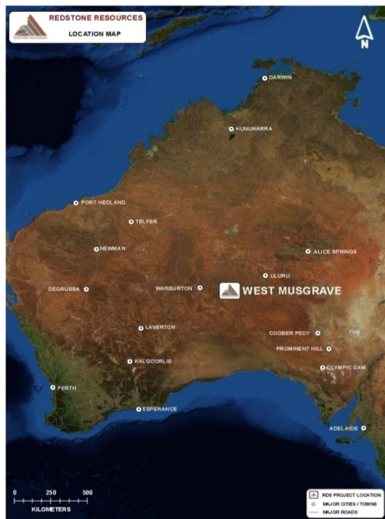
Figure 1 – West Musgrave – Location Map

The Project is prospective for major copper and nickel-copper mineralisation. The tenements and Project location is shown on Figures 1 and 2 .