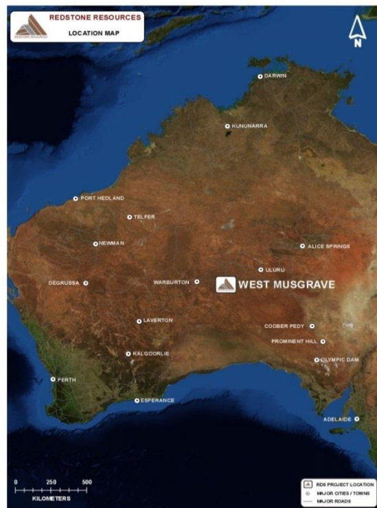
Figure 1 – West Musgrave – Location Map

The Project is prospective for major copper and nickel-copper mineralisation. The tenements and Project location is shown on Figures 1 and 2 .