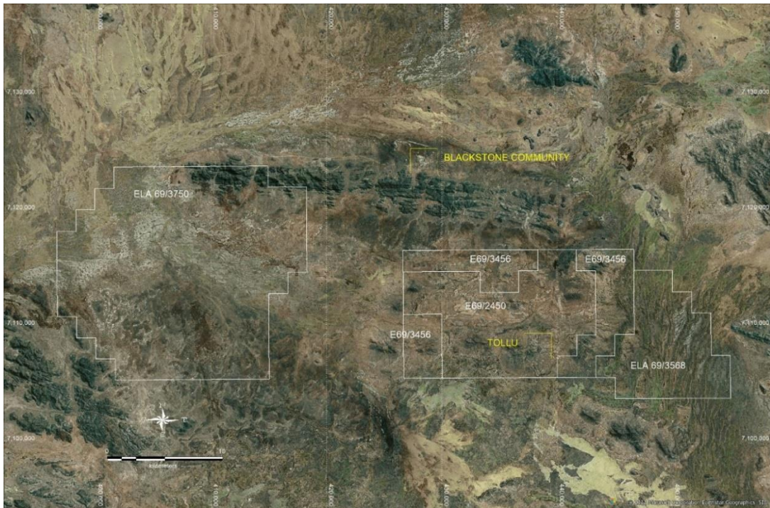
Figure 2– West Musgrave Project Tenements

Redstone's primary focus is the advancement of its 100% owned West Musgrave Project, which includes the Tollu project, located in the southeast portion of the West Musgrave region of Western Australia. The Project has the right geological and structural setting for large magmatic Ni-Cu sulphide deposits just 40km east of the world-class Nebo-Babel Ni-Cu deposit.