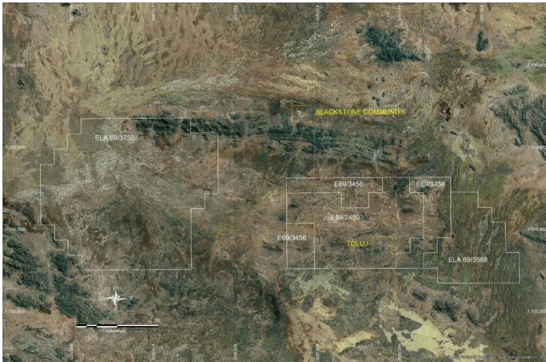
Figure 2– West Musgrave Project Tenements

Redstone’s primary focus is the advancement of its 100% owned West Musgrave Project, which includes the Tollu project, located in the southeast portion of the West Musgrave region of Western Australia. The Project has the right geological and structural setting for large magmatic Ni-Cu sulphide deposits just 40km east of the world-class Nebo-Babel Ni-Cu deposit.