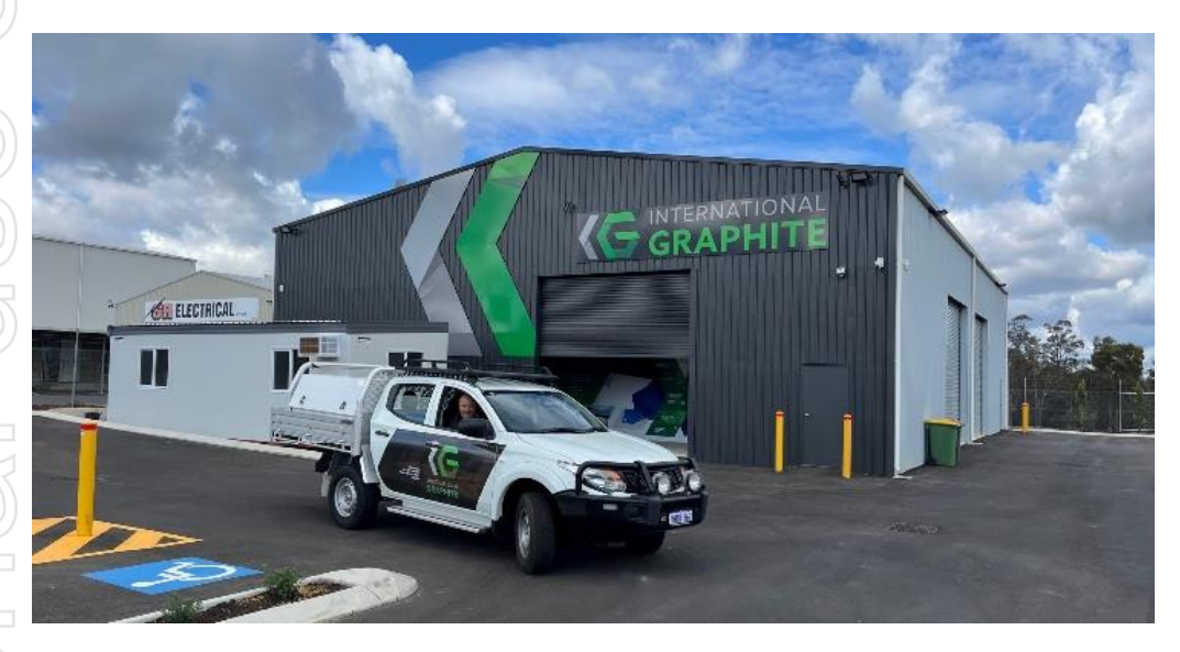
Picture 1: International Graphite's R&D and pilot processing facility in Collie, Western Australia.

"We are extremely pleased with the leadership and support the Western Australian Government is providing to help transition the Collie economy and assist new businesses, like ours, to establish there."