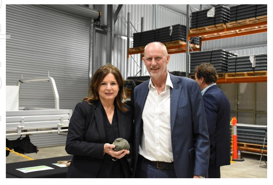
Key DFS findings include:

International Graphite has completed the DFS for a nominal 4,000tpa graphite micronising facility in Collie, Western Australia. Proposed production rates have significantly expanded compared with an initial feasibility study prepared in 2020, which was the basis for the Company's approved $2M funding from the Western Australian State Government's Collie Futures Industry Development Fund.