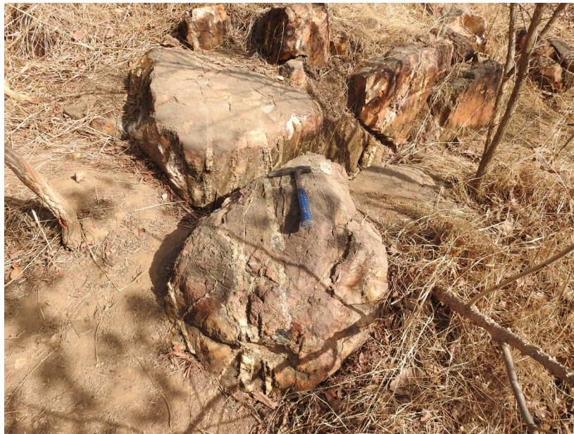
Figure 3: Outcropping felsic dyke with quartz-hematite rich veining

The Sounkou prospect is located in the Bamfele permit, 13km SW of the MRE area at Massan (930,000Oz 2 gold) (Figure 2). At Sounkou, a river channel has exposed outcropping bedrock, which is characterised by iron-rich quartz veining hosted by felsic dykes (Fig 3, 4). The felsic dykes often display a very high abundance of tourmaline (Fig 5), which is generally associated with areas of elevated gold grades in the Massan prospect. Recent rock sampling in the area has yielded multiple samples of anomalous gold, with grades up to 9.8g/t gold