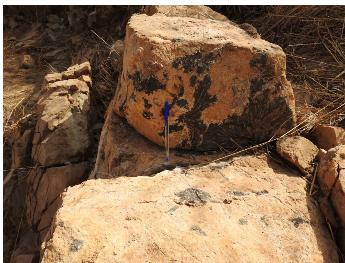
Figure 5: Felsic intrusive rock with significant tourmaline, 1.19g/t Au