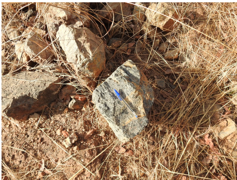
Figure 7: Tourmaline-rich breccia at Nounkoun