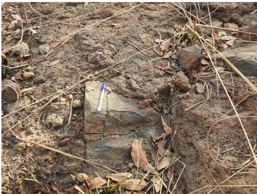
Figure 6: Volcanic breccia at Nounkoun prospect, 3.03g/t Au