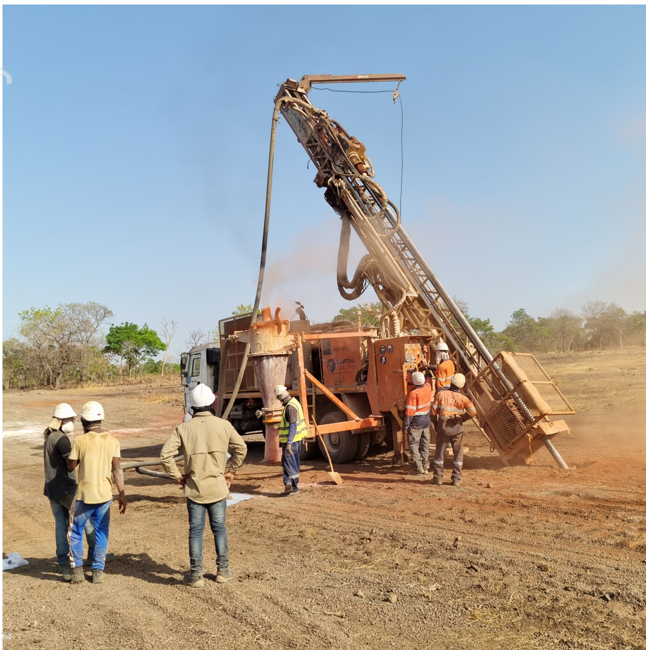
Figure 1: First hole of the 5,000m AC drilling program at Kada Gold Project, Guinea