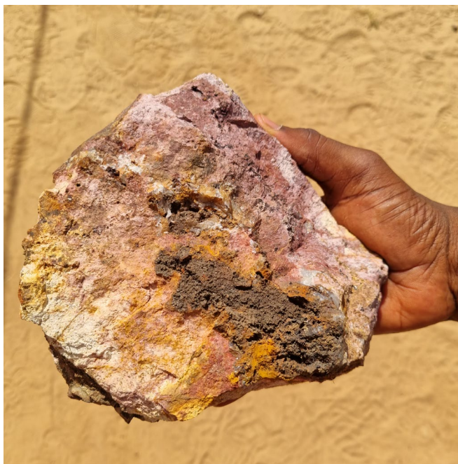
Figure 4: Sample BFL21518 from outcrop in Figure 3, 9.83g/t Au