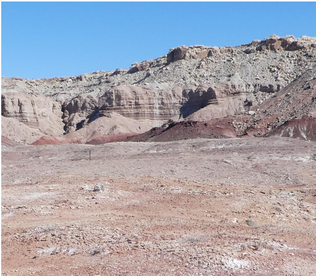
Figure 3: Photo of the Mt Fuel-Skyline Geyser drill pad showing only minor work would be necessary to re-establish the drill pad.