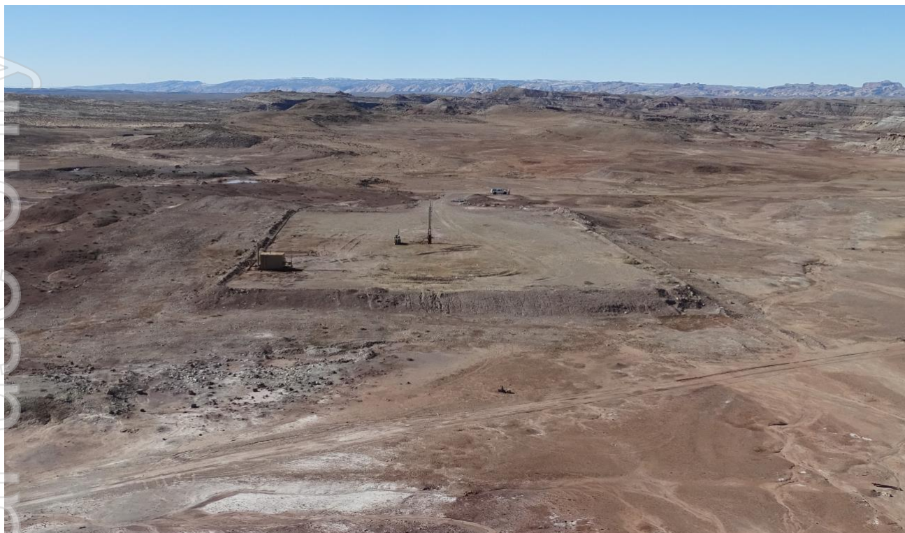
Figure 2: Photo of the established Greentown Fed 26-43H drill pad.