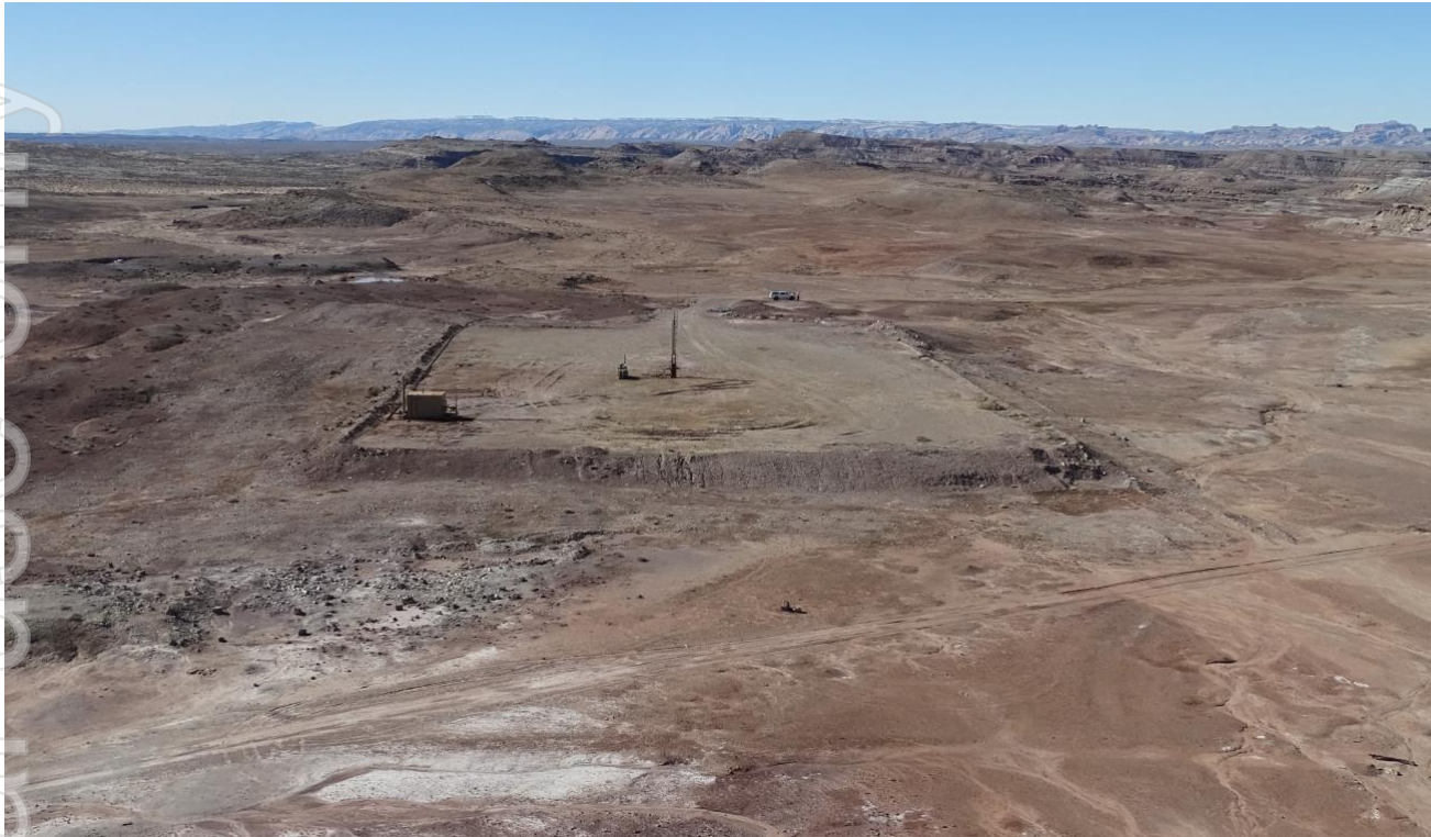
Figure 2: Photo of the established Greentown Fed 26-43H drill pad.