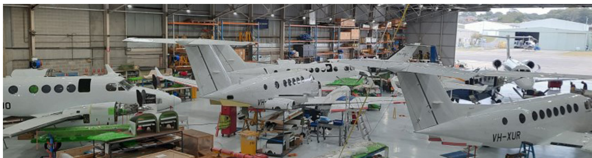
The brand new fleet of Pel-Air Beechcraft King Air aircraft undergoing modifications for the Ambulance Victoria 12-year fixed-wing patient transport contract, which will commence Air Ambulance operations in January 2024.

NJE, a Rex joint venture investment with two other parties, operates eight Dash 8 400 aircraft, six Embraer 190 aircraft, four BAE 146 aircraft and three Dash 8 100 aircraft.