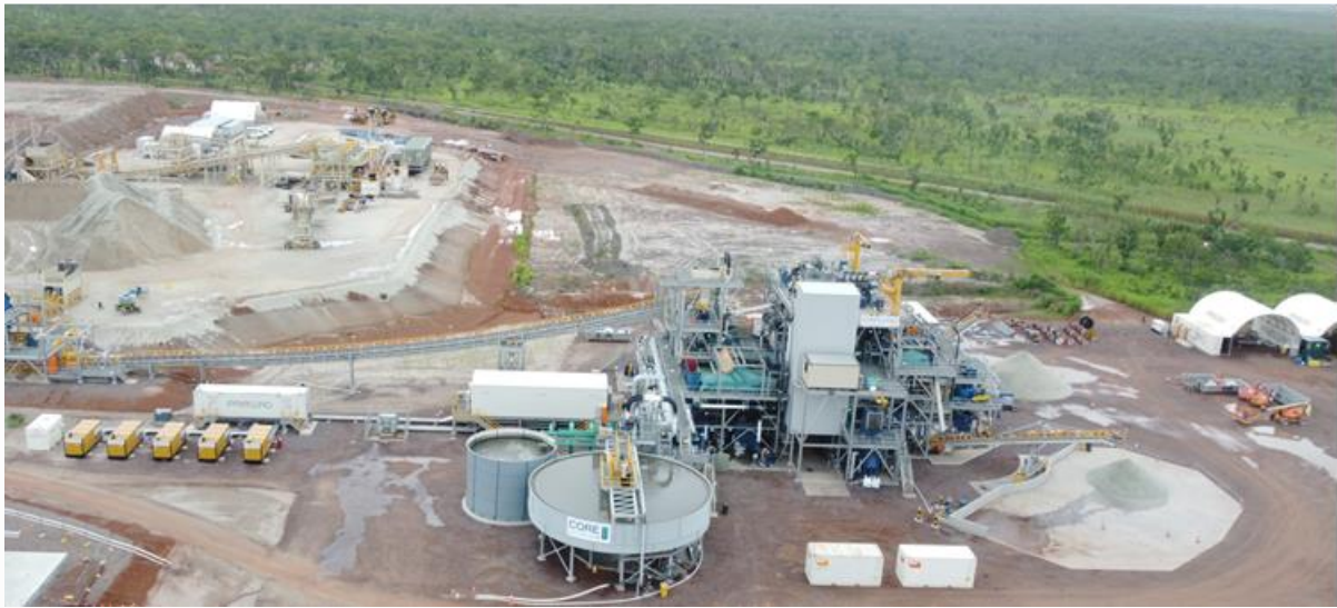
Finniss Spodumene Concentrator