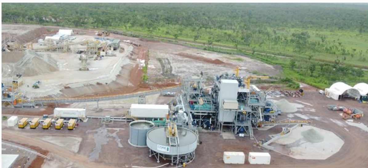
Finniss Spodumene Concentrator