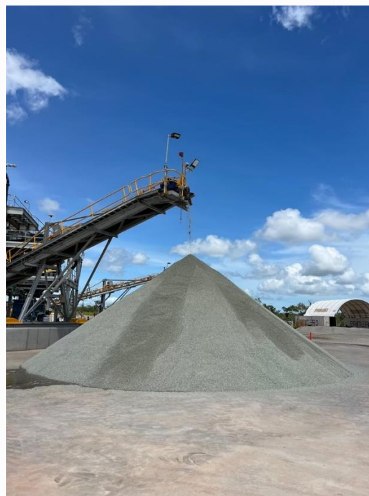
First Concentrate from the Finniss Lithium Mine