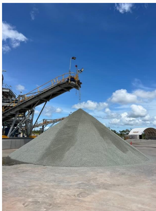
First Concentrate from the Finniss Lithium Mine