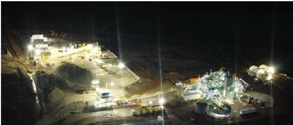
Finniss Processing Facilities – Crushing and DMS Plants at night

Safe commissioning of the DMS plant is a key milestone in the development of the Finniss Lithium Mining Operations and marks the successful completion of construction activities at this ground-breaking project, the first Australian lithium-producing operation outside of Western Australia.