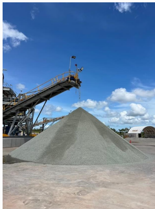
First Concentrate from the Finniss Lithium Mine