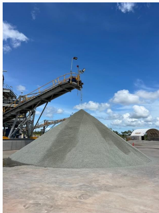
First Concentrate from the Finniss Lithium Mine