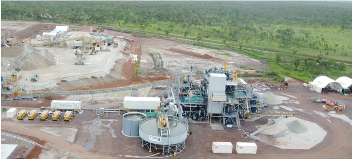
Finniss Spodumene Concentrator