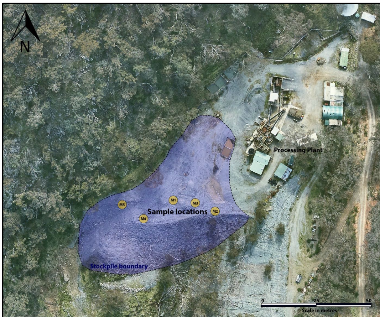
Figure 1 - location of stockpile and sample positions

In 2009 the price of gold was around AUD1156 per ounce (source https://abcbullion.com.au/products-pricing/eofy-price-history ). Back analysis of mine expenditure information in the Company's data archive indicates that this would have related to a break-even grade of around 12g/t Au. Material below this break-even grade would have likely been directed to the mine stockpile by the production geologists at the time. Vertex considers the stockpile to contain material that is economically viable to process and plans to restart the existing processing plant and process enough of the stockpiled material (+100 tonnes) to determine the average grade of the stockpile. If the grade of this initial bulk sample is sufficient to provide an economic benefit, the Company will continue to process the stockpile.