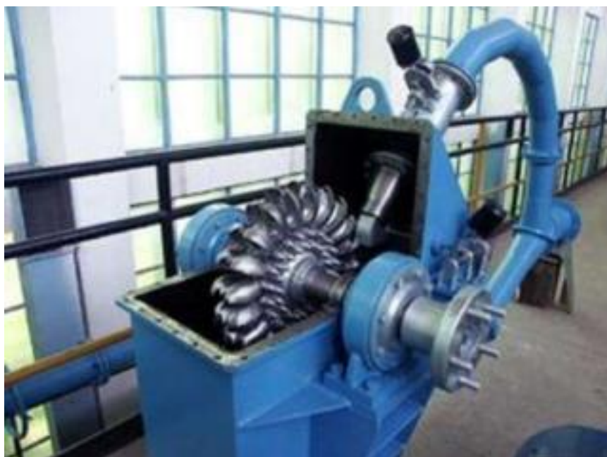
Figure 1: Example of commercially available Small Pit Pelton hydro power unit for location at the recovery site

In addition, the Worley study identified that power may also be generated as the brine enters the lithium extraction and processing plant. A small powerhouse would need to be constructed to house the turbine and generator to produce up to 3MW of power , see Figure 2.