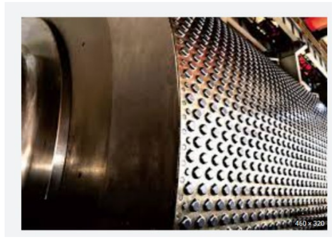
Image of an abrasion resistant HPGR studded roll