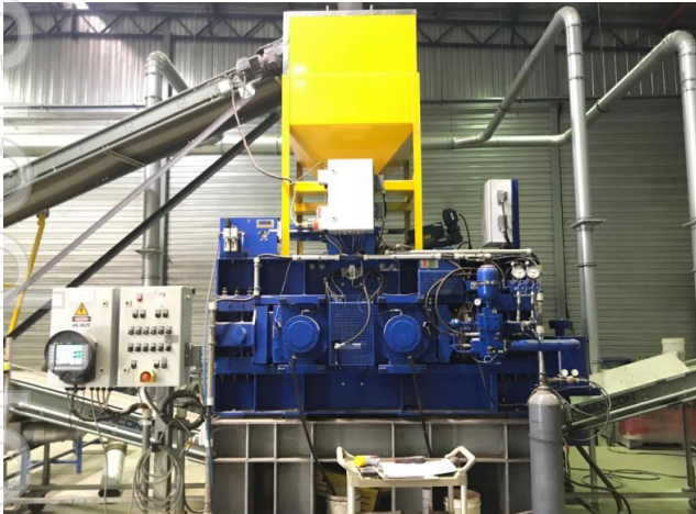
HPGR test unit at Bureau Veritas Minerals Laboratory, Perth, Australia