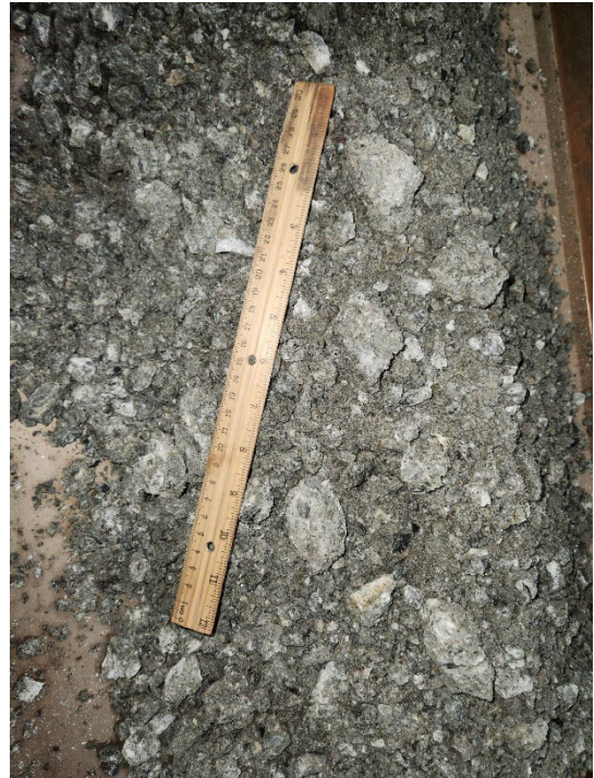
Caravel ore crushed using Enduron® test unit