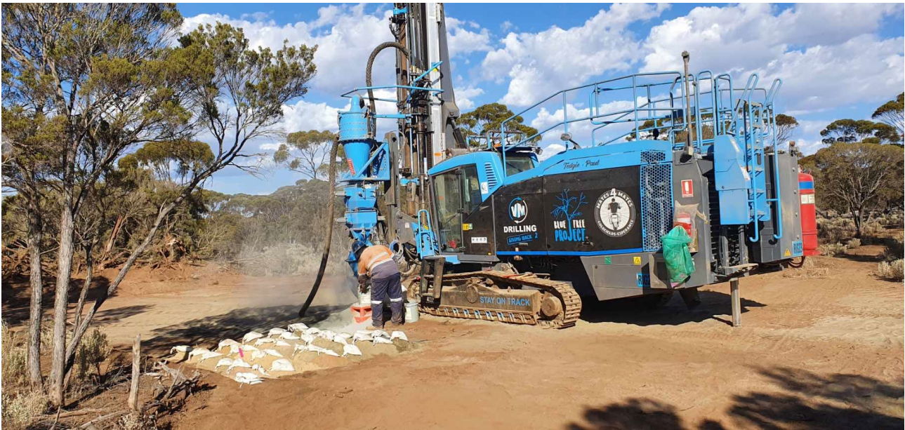
Figure 1. Grade Control drilling at Jeffreys Find.