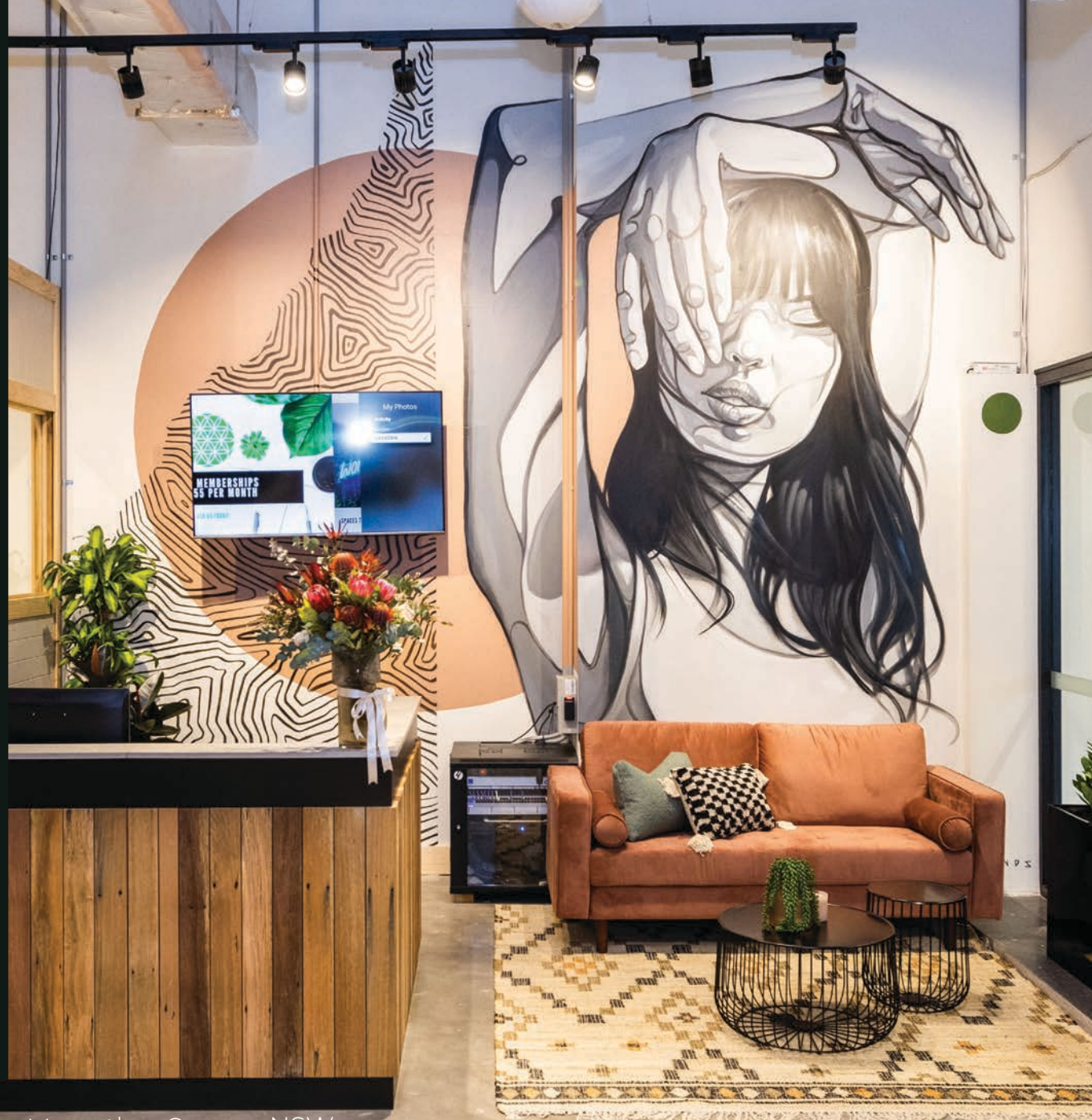
Macarthur Square, NSW