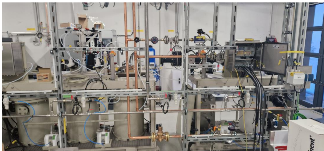
Figure 2 – Pilot Plant Vessels and Equipment