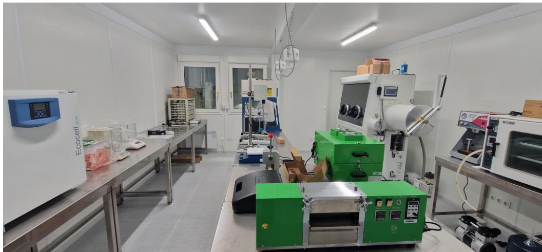
Figure 1 – Pilot Plant Laboratory