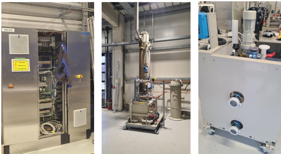
Figure 4 – Electrical Board and Various Equipment

Altech's pilot plant personnel have been recruited and trained in Germany, ready for the commissioning and start-up phase of the pilot plant. The commissioning of the front end of the pilot plant is currently underway. Aluminium chloride feedstock digestion, which will be used for the alumina coating process, will be commissioned in the subsequent weeks. The Kuettnner engineering team is now focused on the development of commissioning and operational documentation. The pilot plant is designed to produce 120kg per day of the Silumina Anodes™ product, which will then be provided to selected potential end users for product testing.