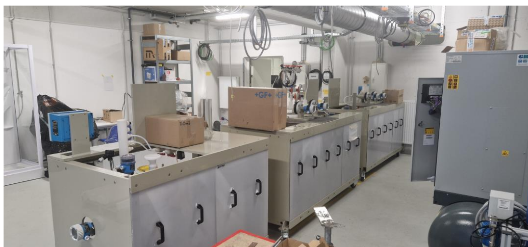
Figure 3 – Pilot Plant Test Equipment