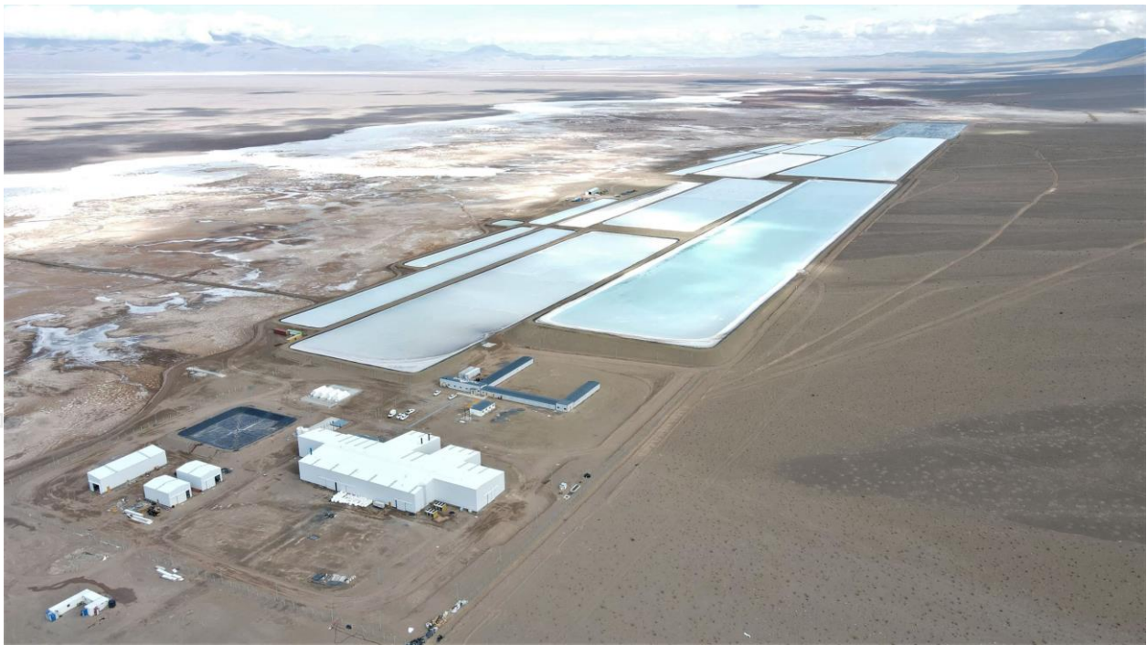
Figure 3. Rincon Lithium Project – 2,000tpa Operations Site

Argosy is well positioned to take advantage of current and near-term lithium prices via the 2,000tpa production operations, with the Benchmark Mineral Intelligence lithium carbonate CIF Asia (spot) price recently quoted at US$76,000/t.