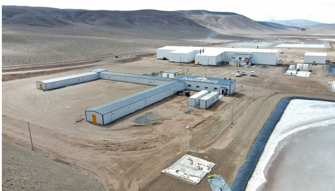
Figure 8. Rincon Lithium Project – 2,000tpa Operations Site