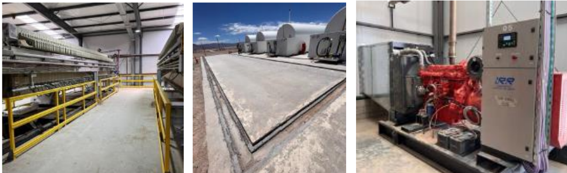
Figures 4-6. Rincon Lithium Project – 2,000tpa Operation Commissioning Works