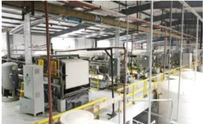
Figures 1-2. Rincon Lithium Project – 2,000tpa Operation Commissioning Works