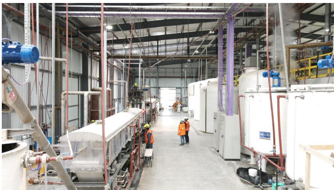
Figure 7. Rincon Lithium Project – 2,000tpa Operation Commissioning Works