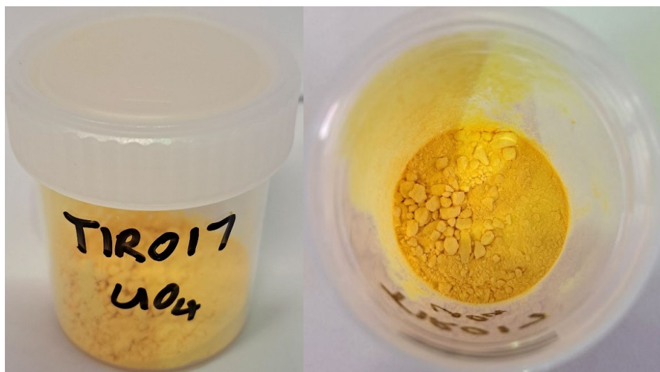
Figure 2 - Aura's Yellowcake Successfully Produced at ANSTO

program at the ANSTO laboratory and indicates that Tiris production could be sold in the international market as a high-standard product without penalties 1 .