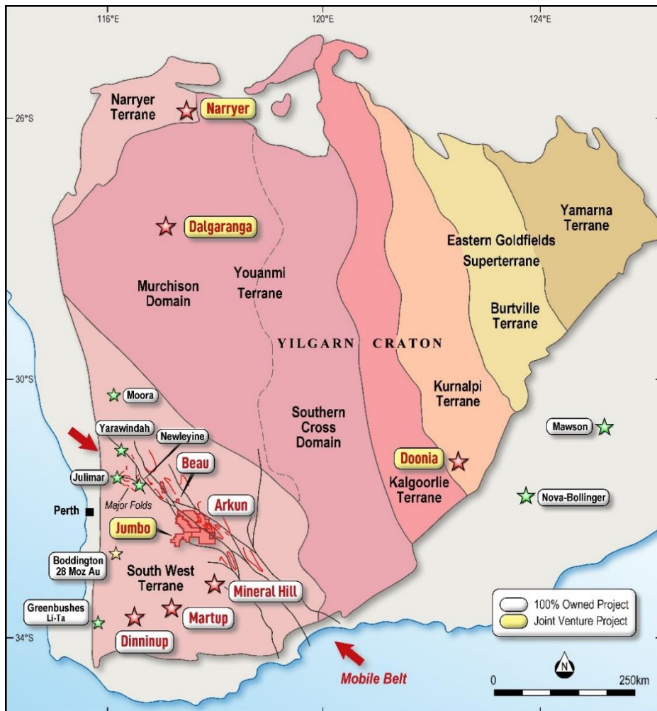
Figure 1. Location of Impact's projects in Western Australia.

Current work programmes aim to define drill targets at the flagship Arkun-Beau-Jumbo area. Other projects are also being progressed via compilations of previous work and preliminary interpretations of the surface and bedrock geology to identify areas of interest for follow-up exploration.