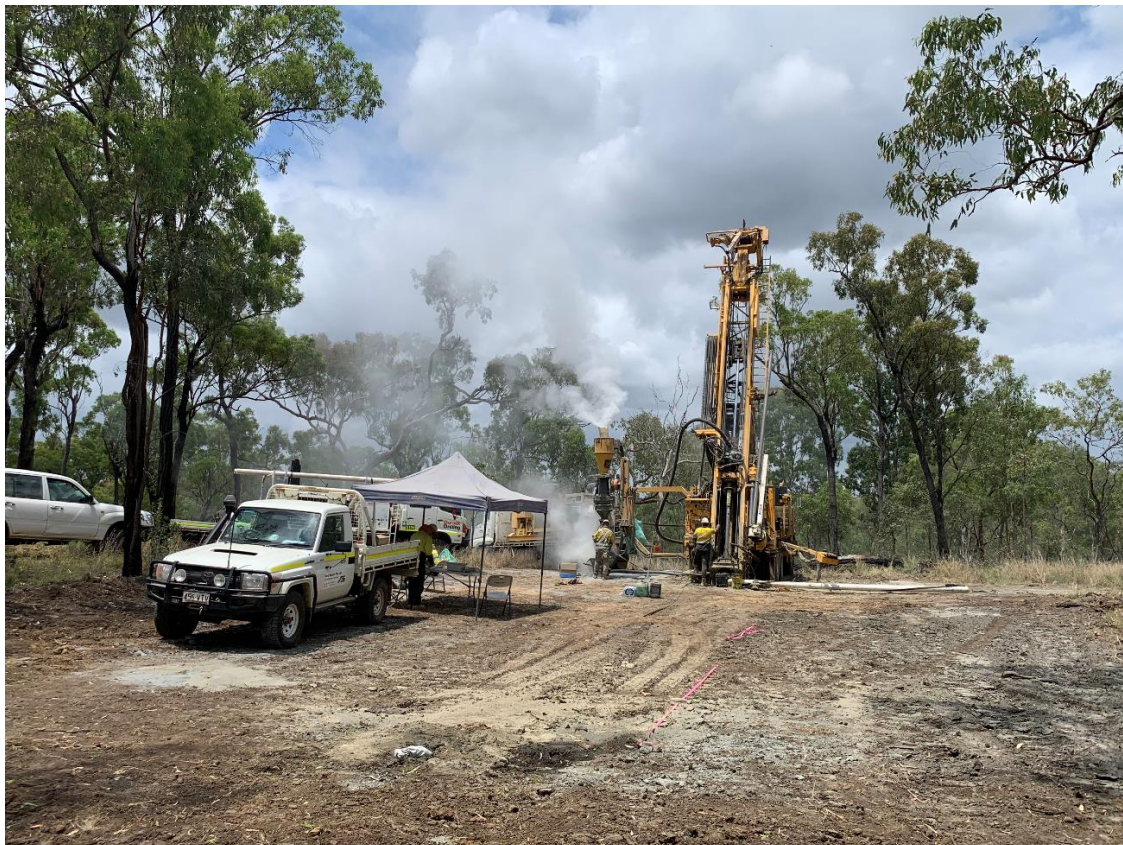
Figure 1 RC drill rig at Douglas Creek