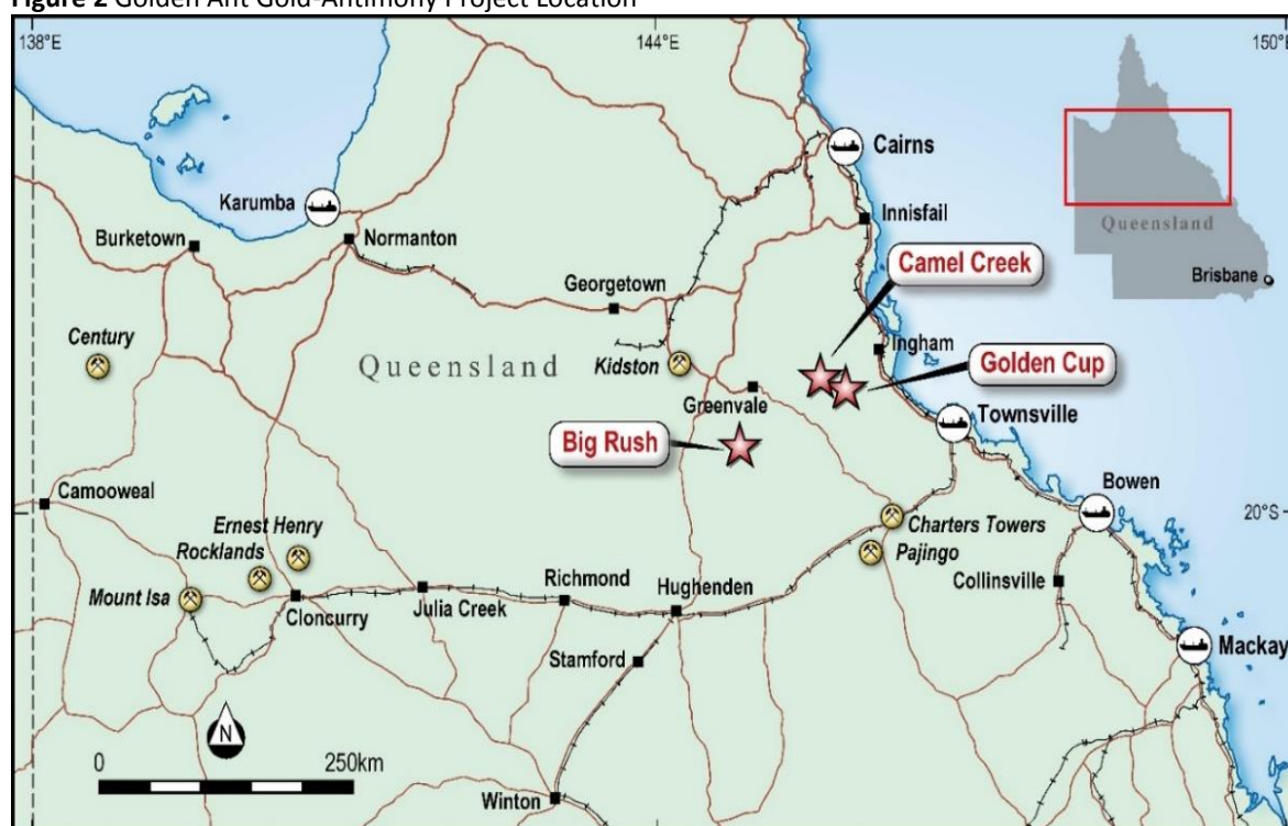
Figure 2 Golden Ant Gold-Antimony Project Location