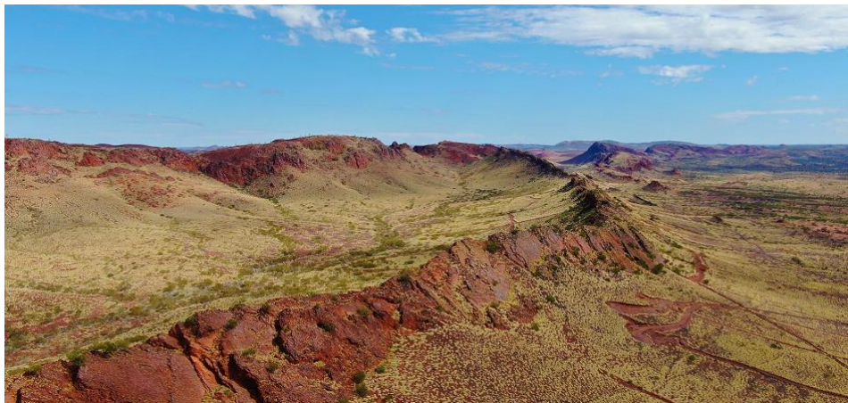
Figure 3: Paulsens East Hematite Ridge

Paulsens East consists of a three-kilometre-long outcropping high-grade hematite ridge (refer Figure 3), containing a JORC Indicated Mineral Resource of 9.6 Million tonnes at 61.1% Fe , 6.0% SiO 2 , 3.6% Al 2 O 3 , 0.08% P (at a cut-off grade of 58% Fe). 4