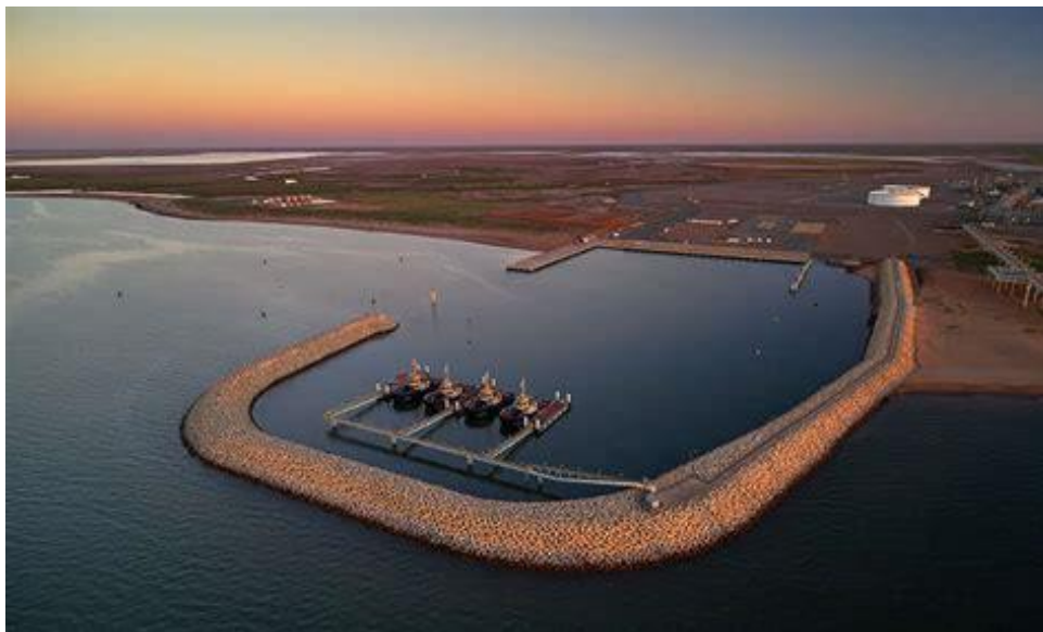
Figure 2: Port of Ashburton - Onslow

CSL Australia is a division of the CSL Group Inc., which is the world's largest owner and operator of self-unloading vessels. CSL Australia currently provides transshipment services for the export of iron ore from Cape Preston in Western Australia and Whyalla in South Australia. CSL has considerable experience in the loading and transportation of bulk materials including iron ore and has agreed to join the PAC as a part-owner of the Port of Ashburton West Quay Facility and to provide transshipment services to Strike and CZR.