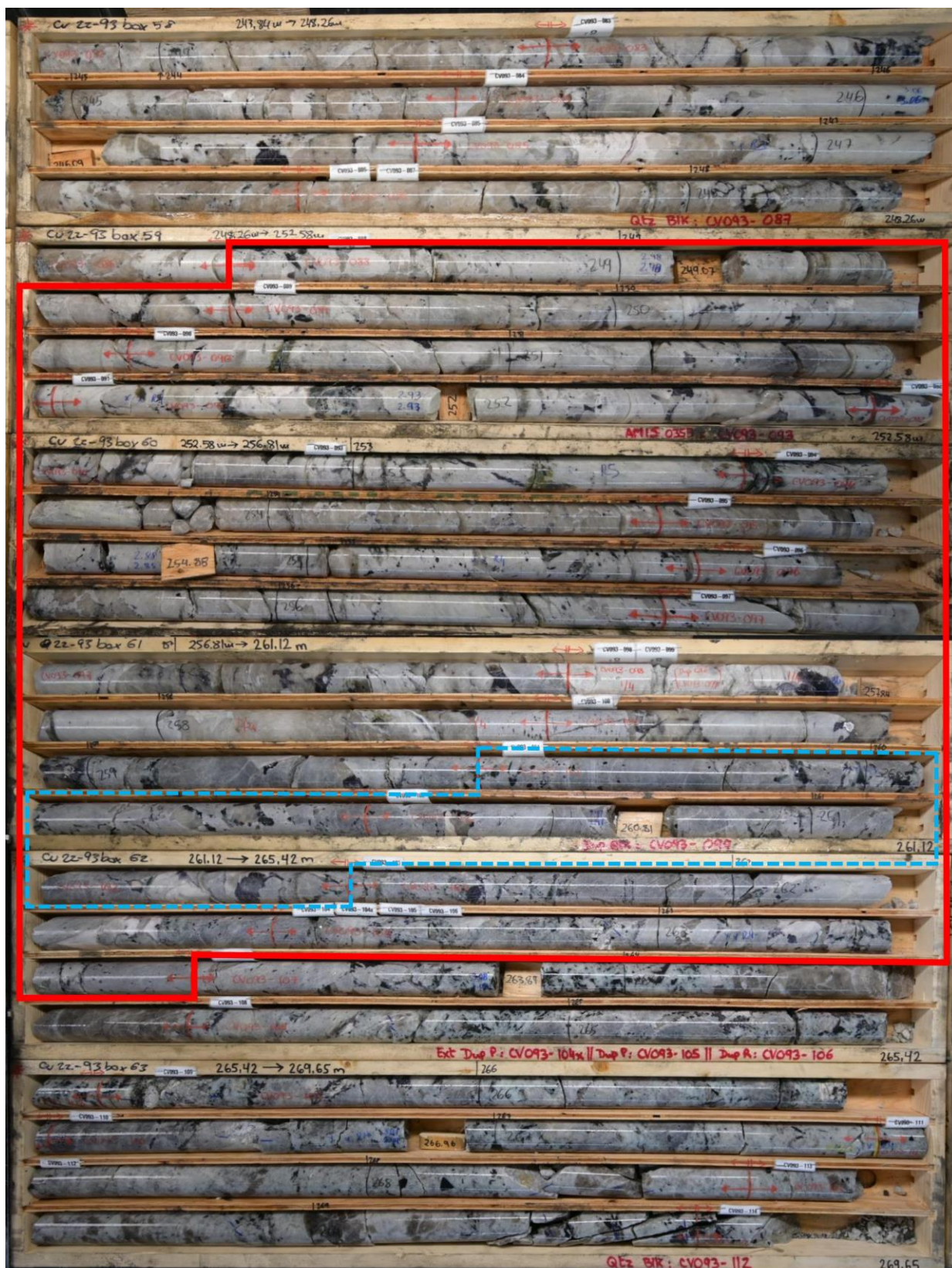
Figure 2: High-grade Nova Zone drill core intersection (15.0 m at 5.10% Li 2 O) in CV22-093 (red box), including 2.0 m at 6.17% Li 2 O (dashed blue box)