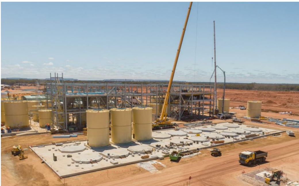
Carbonation area – Slab and plinths completed, tank installation underway.