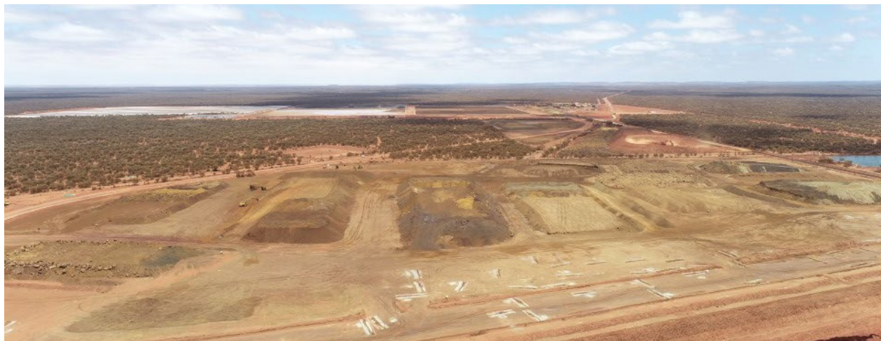
Aerial Photo: Run of mine stockpiles with Campaign 4-1 ores

Building the lanthanide concentrate stockpile in Mt Weld for the Kalgoorlie Rare Earth Processing Facility is on schedule as Mt Weld manages both the increasing demand from Lynas Malaysia and inventory build-for the Kalgoorlie start up.