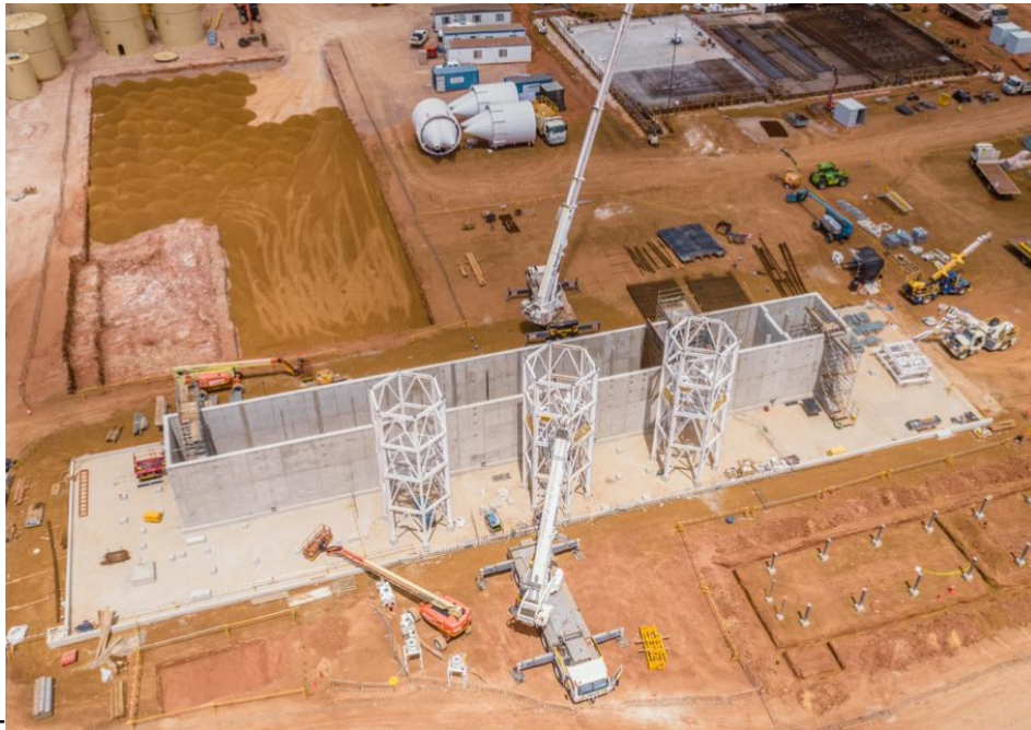
MgO Tanks. Outer walls complete, two inner walls completed, silo structures installed. Excavation for load in system and Chemicals warehouse in the rear.