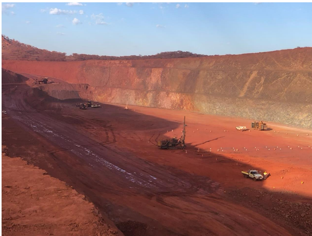
Fenix's Iron Ridge Iron Ore Mine, January 2023

Fenix has implemented appropriate COVID-19 protocols at all operational sites to protect the health, safety and wellbeing of the Company's people. Fenix has not been materially affected by COVID-19 and is committed to maintaining policies and procedures that, in line with prevailing health regulations, ensure our people are safe and that operational impacts are minimal.