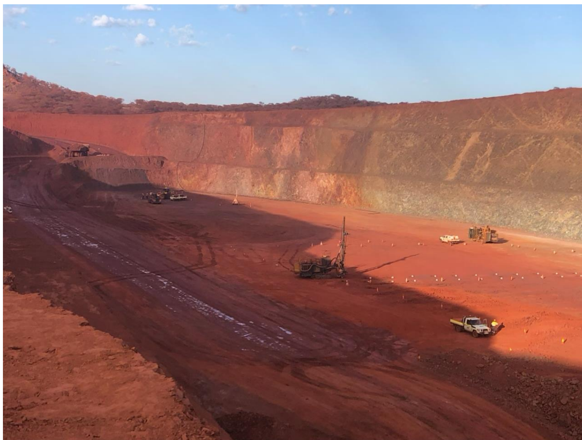
Fenix's Iron Ridge Iron Ore Mine, January 2023

Fenix has implemented appropriate COVID-19 protocols at all operational sites to protect the health, safety and wellbeing of the Company's people. Fenix has not been materially affected by COVID-19 and is committed to maintaining policies and procedures that, in line with prevailing health regulations, ensure our people are safe and that operational impacts are minimal.