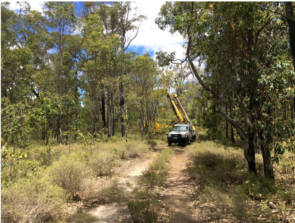
Figure 3: RC drilling underway on an existing track at the East Kirup Lithium Prospect

The exploration at E70/4763 is ongoing. A mapping and sampling program will commence next week at the Thomas A Prospect, which is an area of arsenic anomalism, which is a proxy for lithium in the Greenbushes region and is where historically pegmatites and surface kaolinite have been mapped.