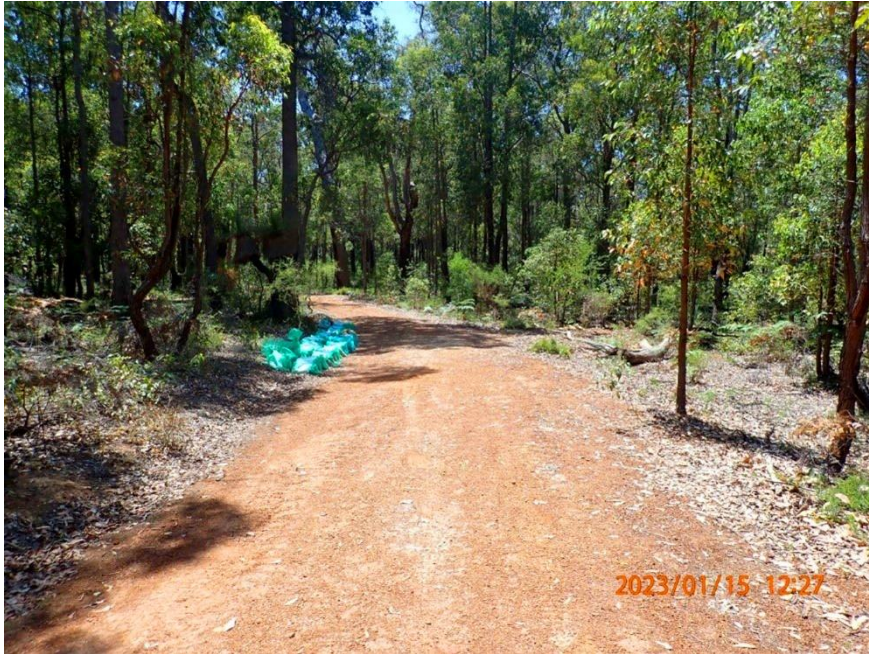
Figure 4: A rehabilitated RC drill pad at the East Kirup Lithium Prospect

“We are delighted with the RC drilling progress and results so far. The work has been carefully planned and conducted in accordance with an approved Conservation Management Plan (CMP). We look forward to the results of the diamond drilling program that is underway.”