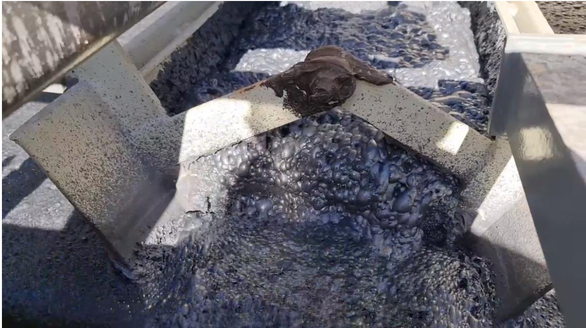
Figure 2 – Lead-silver concentrate in Abra's flotation circuit (Photo 12 January 2023).

The Board of Directors of Galena authorised this announcement for release to the market.