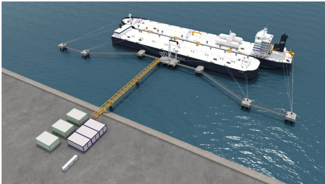
Figure 2: Illustration of a Provaris' H2Neo Carrier and conceptual Compressed H2 Floating Storage solution suitable for export and import use cases.

With many pilot projects well under way, availability of low-cost renewable energy (largely from wind and hydro-power), and a Government highly supportive of initiatives to develop technologies, projects and to scale up hydrogen production and exports, Norway has numerous project sites that can be developed for large scale exports commencing in 2027 to off-takers in the EU.