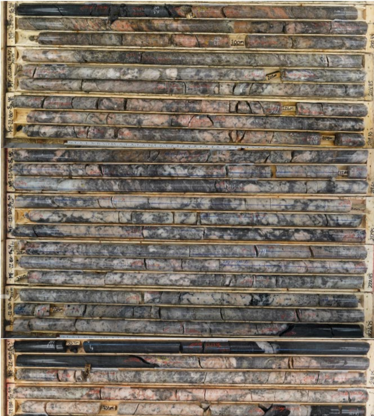
Figure 4 - MF22-180 drill core photo, over 30m of spodumene from 197m down hole