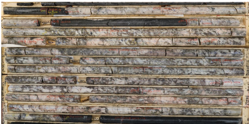
Figure 2 – MF22-177 drill core showing spodumene laths from 258.55 to 274.8m down hole, a potential new zone of spodumene mineralisation, stacked under the Mavis Lake Main Zone