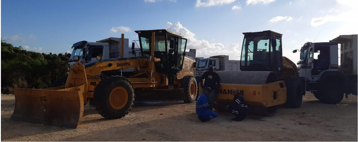
Figure 2 - Civil contractors arriving at the Alameda well pad to commence work

Melbana’s civil contractor arrived onsite last week to commence these works, which are expected to take only three or four weeks.