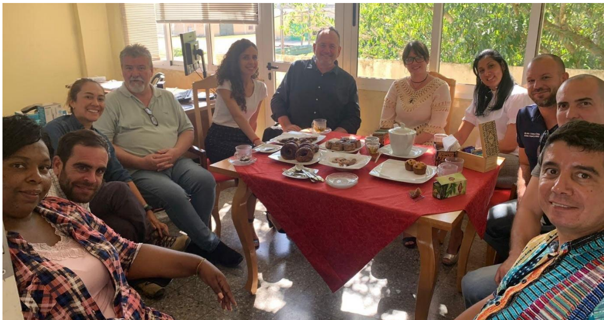
Figure 7 - Morning tea with members of Melbana's operations team in Varadero to explain the 2023 work program

These oil influxes under high pore pressures with good porosity and high mud gas readings make this Amistad interval a strong candidate for an appraisal well. The objectives of this appraisal well, in addition to sampling the oil to determine its quality, is to flow oil from each of these units to determine whether there is communication between them and, if so, to what extent.