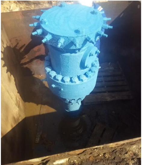
Figure 4 – Zapato-1 well head environmentally sealed

Following the completion of works at Alameda, Melbana’s civil contractor will complete the remediation of the Zapato well pad and fill in the cellar containing the well head.