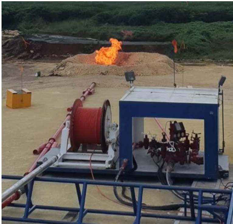
Figure 6 - Flaring operations whilst drilling Alameda-1 (Unit 3, Upper Sheet)

Alameda-1 received oil across the shakers almost immediately upon drilling out the surface casing, which was set at 453 metres MD. There was an almost continuous oil sheen on the shakers down to 1,130 metres MD, then again from 1,605 metres MD to 1,790 metres MD. High background gas with heavy components was observed throughout and drilling cuttings showed oil impregnation and fluorescence. At 1,842 metres MD, the well needed to be shut in and flared off, with a dark yellow flame indicating the presence of heavier hydrocarbons than just gas. Log pay has been interpreted within this interval where data quality was good and strong oil shows were encountered.