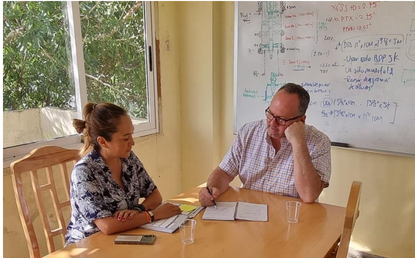
Figure 5 - Chairman and HSE Manager, Melbana's Operational Headquarters, Varadero