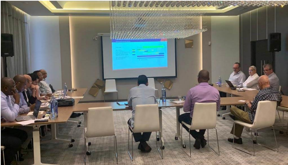
Figure 1 – Representatives of Melbana, CUPET and Sonangol meeting in Havana, December 2022

Subsequent to these meetings, the Block 9 partners ( Sonangol Pesquisa & Produção (Sonangol) and Melbana, as operator) formally approved the 2023 work program and budget that had first been presented at meetings held in Melbourne back in August of this year.