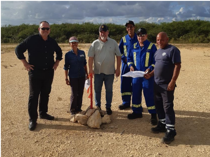
Figure 3 - Surveyors marking the site of the Alameda-2 appraisal well