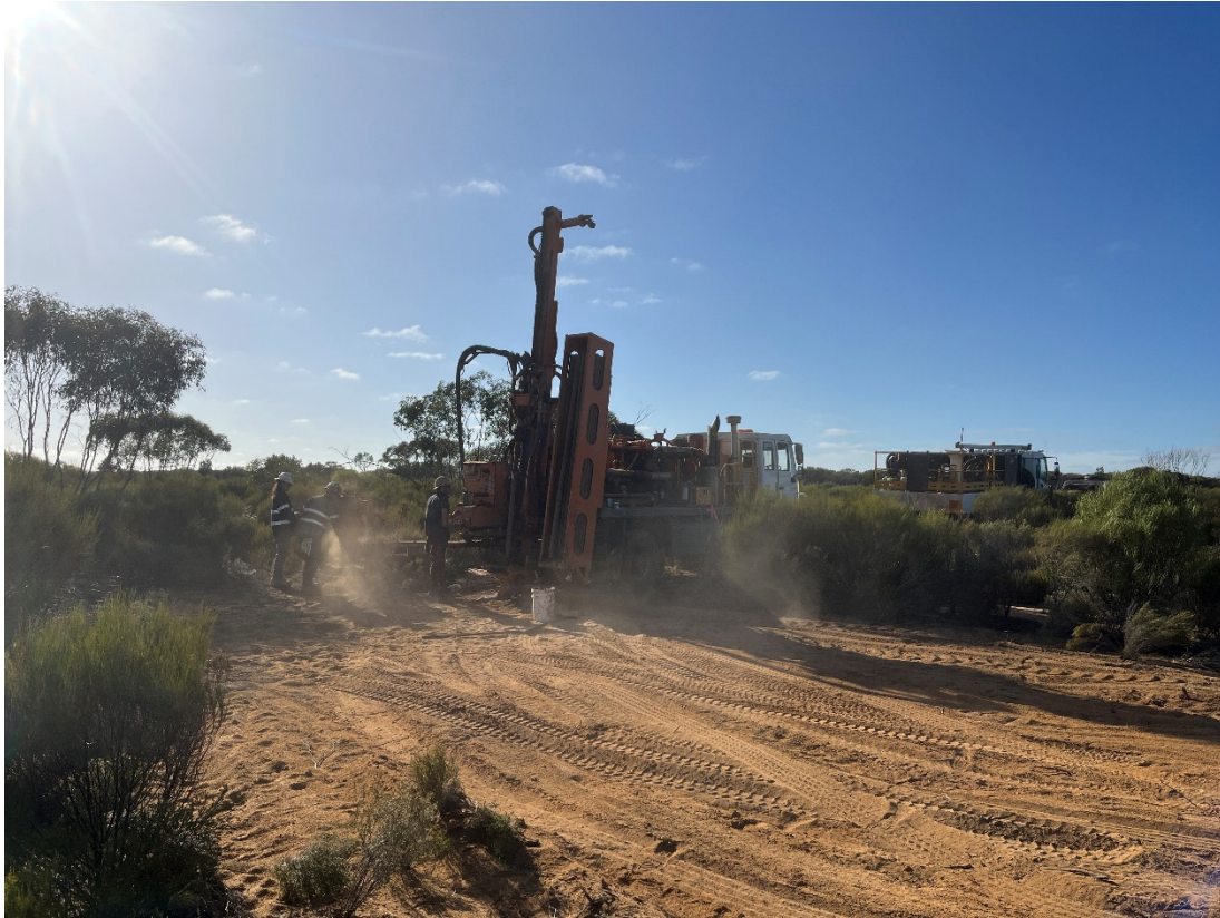
Figure 3. KTE Mining Aircore rig drilling at Koolya Kaolin Project.

This announcement has been authorised for release by the Directors of the Company.