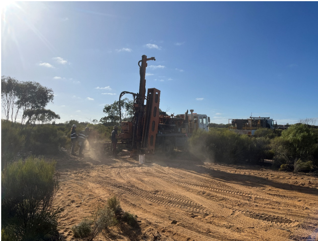
Figure 3. KTE Mining Aircore rig drilling at Koolya Kaolin Project.

This announcement has been authorised for release by the Directors of the Company.