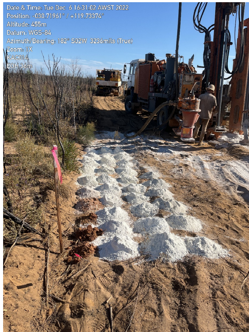
Figure 1. High quality Kaolin intersected 30m of bright white kaolin from 4m depth (KAC014).