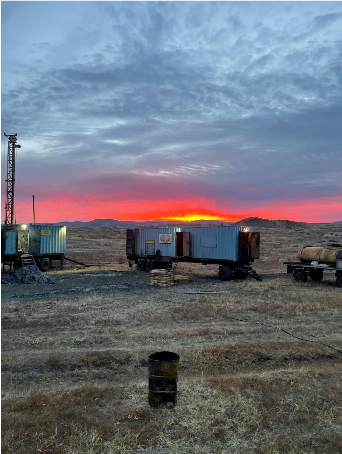
Figure 1 – Diamond Drilling at the SarytoGAN Graphite Deposit