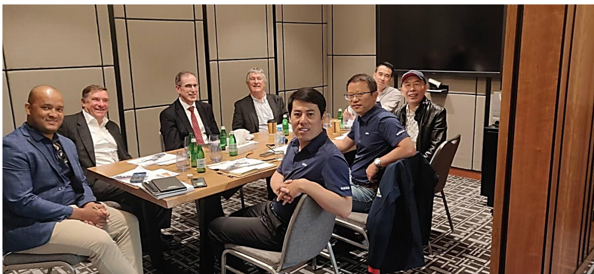
Figure 1 – Representatives of St George and SVOLT met in Perth during November 2022.

The MoU is non-exclusive and each party may pursue business opportunities with any other third party.