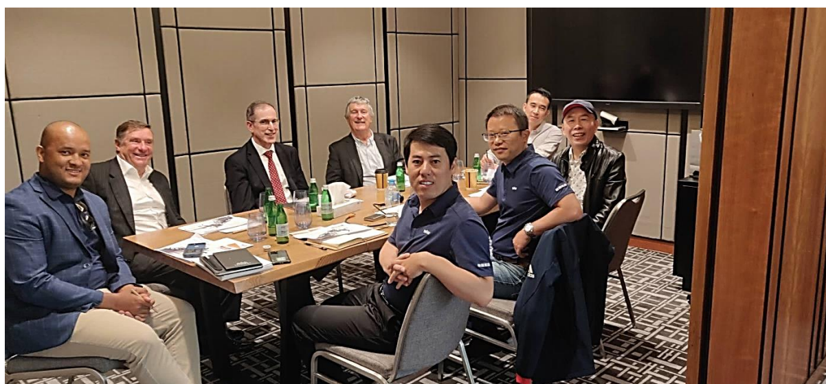
Figure 1 – Representatives of St George and SVOLT met in Perth during November 2022.

The MoU is non-exclusive and each party may pursue business opportunities with any other third party.