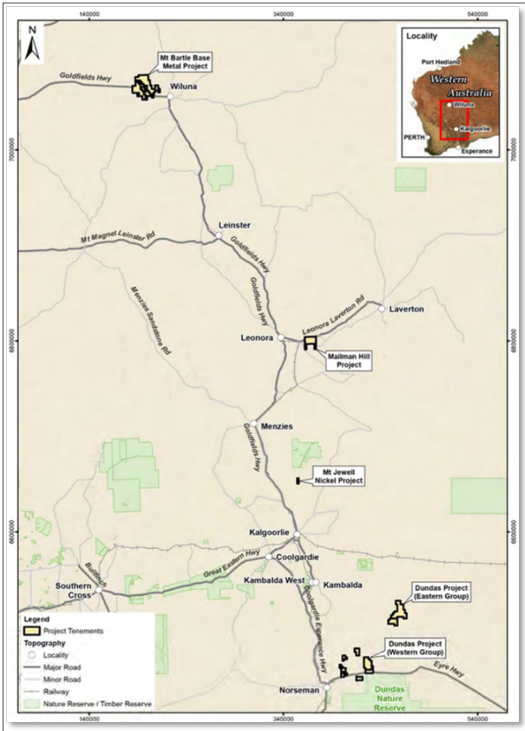
Figure 3: Lightning Minerals' project summary

This announcement has been approved for release by the Board of Directors.