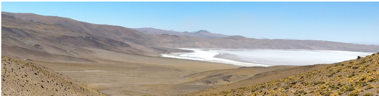
HMW Project looking north from Pata Pila

Greenbushes South Lithium Project: Galan has an Exploration Licence application (E70/4629) covering a total area of approximately 43 km 2 . It is approximately 15kms to the south of the Greenbushes mine. In January 2021, Galan entered into a sale and joint venture with Lithium Australia Ltd for an 80% interest in the Greenbushes South Lithium project, which is located 200 km south of Perth, the capital of Western Australia. With an area of 353 km 2 , the project was originally acquired by Lithium Australia NL due to its proximity to the Greenbushes Lithium Mine ('Greenbushes'), given that the project covers the southern strike projection of the geological structure that hosts Greenbushes. The project area commences about 3km south of the current Greenbushes open pit mining operations.