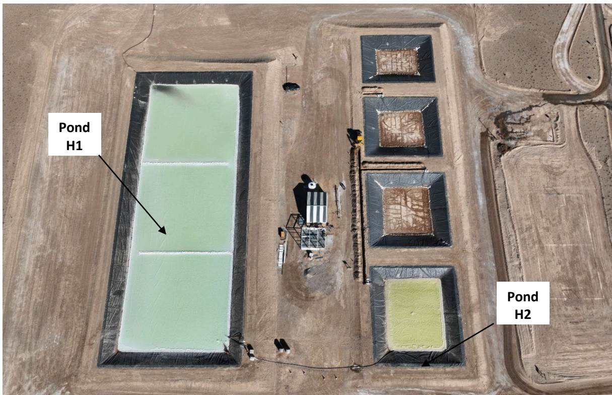
Figure 3 – Aerial view of original HMW Pilot Plant

The original pilot plant ramp-up is progressing to schedule. Figure 3 shows ponds H1 and H2 which have both achieved the expected brine quality. The addition of raw brine continues to support the required brine volumes to commence continuous production of lithium chloride concentrate expected in Q2 CY2023. The continuous production of substantial volumes of 6% Li concentrated brine, will further facilitate Galan's ability to engage with potential off take partners. In particular, product purchasers will be able to readily undertake conversion trials so as to validate and confirm the ability of the brine concentrate to be converted into high-quality Li products.