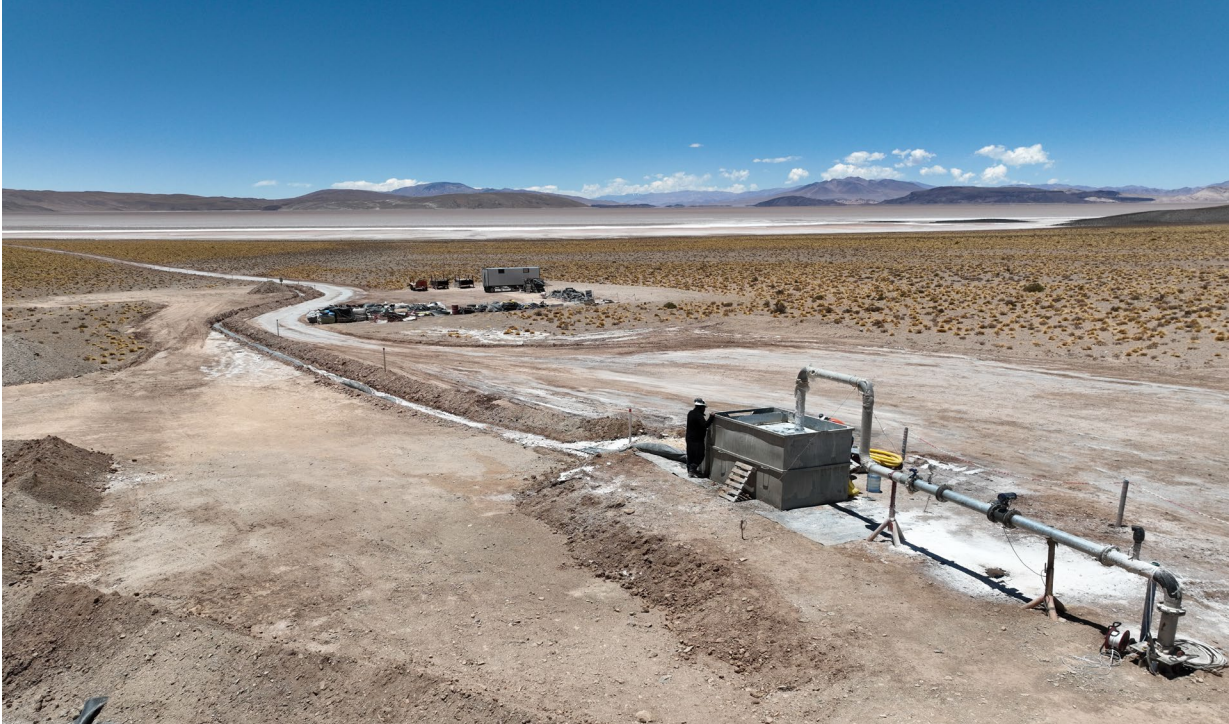
Figure 2 – PPB-02-22 long-term pumping test on Pata Pila tenement

The third long-test pumping test at the HMW Project is currently being undertaken on the PPB-02-22 well (Pata Pila), which is located approximately 930 metres upgradient from the PPB-01-21 well. The test on PPB-02-22 is approximately half complete and is running at a steady flow of 20 L/s. Brine samples and levels are being regularly obtained for laboratory analysis.