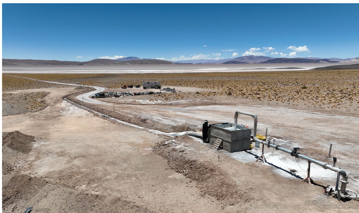
Figure 2 – PPB-02-22 long-term pumping test on Pata Pila tenement

The third long-test pumping test at the HMW Project is currently being undertaken on the PPB-02-22 well (Pata Pila), which is located approximately 930 metres upgradient from the PPB-01-21 well. The test on PPB-02-22 is approximately half complete and is running at a steady flow of 20 L/s. Brine samples and levels are being regularly obtained for laboratory analysis.